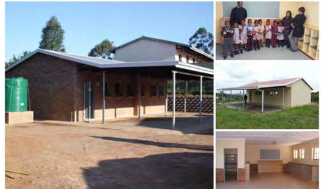
76 EARLY CHILD DEVELOPMENT CENTRE Location: La Mercy