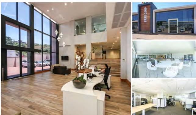
KYALAMI OFFICE PARK