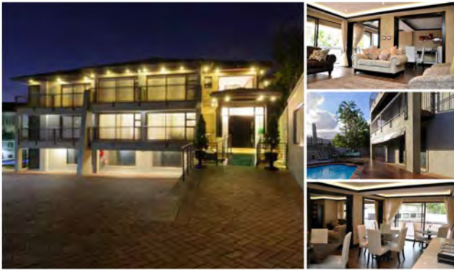
555 ON ESSENWOOD BED & BREAKFAST Location: Musgrave