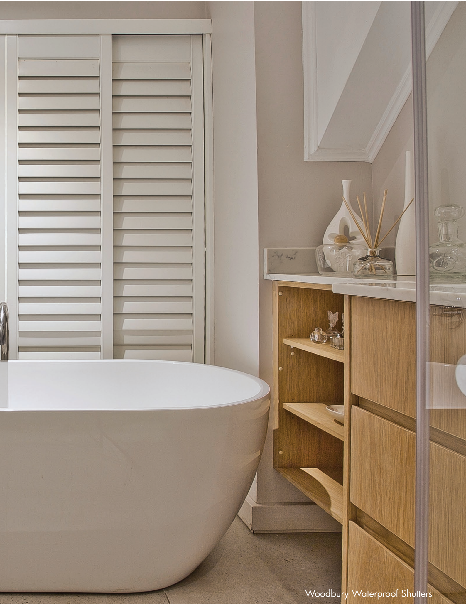
Woodbury Waterproof Shutters