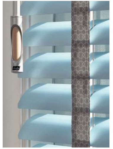
Wood design accent in tassel and tilt rod