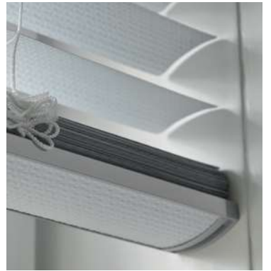
Slat featured in the design of the bottom rail