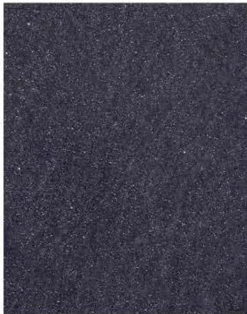
MY FAVOURITE SHOE