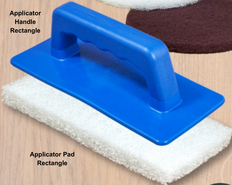
Applicator Pad Rectangle