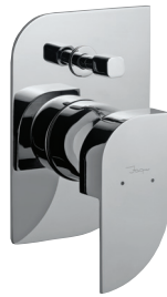
ALI-85079K Single Lever Exposed Parts Kit of the Flow Divertor Consisting of Operating Lever, Wall Flange (With Seals) & Button Only (Suitable For Item ALD-079)