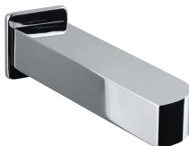
SPJ-85429 Alive Bath Tub Spout With Wall Flange