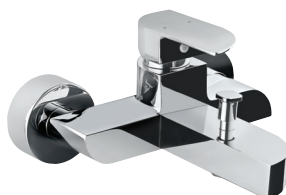
ALI-85119 Single Lever Wall Mixer With Provision of Hand Shower, But W/O Hand Shower