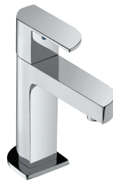
ALI-85001 Basin Tap