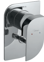
ALI-85193K Single Lever 3-inlet Divertor Exposed parts kit Consisting of Operating Lever, Wall Flange & Button Only (Suitable For Item ALD-193)