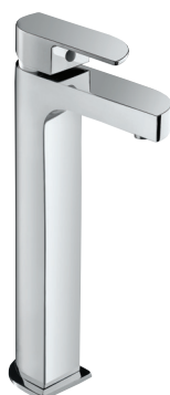
ALI-85005B Single Lever Tall Boy with 125mm Extension Body Fixed Spout without Pop-up Waste System with 600mm Long Braided Hoses