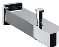
SPJ-85463 Alive Bath Tub Spout With Button Attachment For Hand Shower With Wall Flange