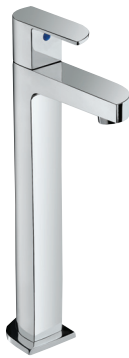
ALI-85021 Basin Tap with 135mm Extension Body