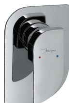
ALI-85227 Single Lever Concealed Deusch Mixer with Provision for Connection to Overhead Shower only