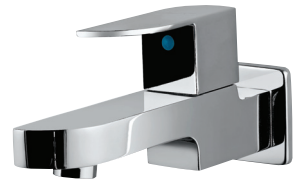
ALI-85037 Bib Tap with Wall Flange