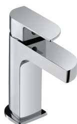
ALI-85011B Single Lever Basin Mixer without Pop-up Waste System with 375mm Long Braided Hoses

Also available Add - 85051B Single Lever Basin Mixer with Pop-up Waste System with 375mm Long Braided Hoses