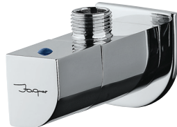
ALI-85053 Angular Valve with Wall Flange