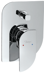
ALI-85065K Single Lever Exposed Parts Kit of Divertor Consisting of Operating Lever, Wall Flange (With Seals) & Button Only (Suitable For Item ALD-065)