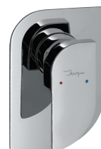
ALI-85229 Single Lever Concealed Deusch Mixer with Provision for Connection to Spout only