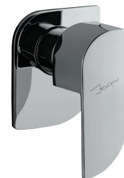
ALI-85083K Exposed Part Kit of Concealed Stop Valve with Fitting Sleeve, Operating Lever & Adjustable Wall Flange with Seal (compatible with ALD-083 & ALD-089)