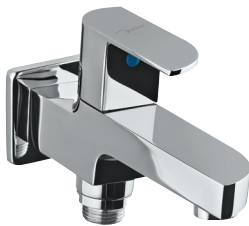
ALI-85041 2 Way Bib Tap with Wall Flange