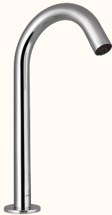
SNR-CHR-51449 Blush High Neck Deck Mounted Sensor faucet with Control Box (Battery Operated)