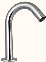
SNR-CHR-51445 Blush Deck Mounted Sensor faucet with Control Box (Battery Operated)