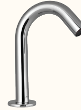
SNR-CHR-51445PK Blush Deck Mounted Sensor faucet with Control Box & Pre-mixed Water Supply Kit (Battery Operated)