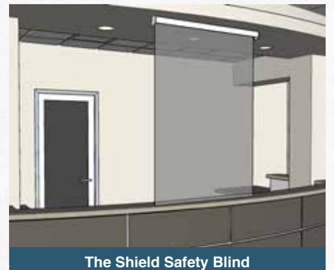
The Shield Safety Blind