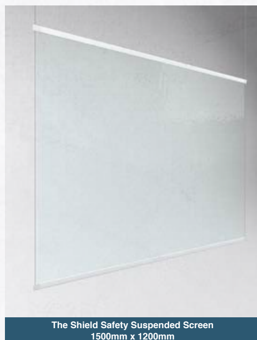
The Shield Safety Suspended Screen 1500mm x 1200mm