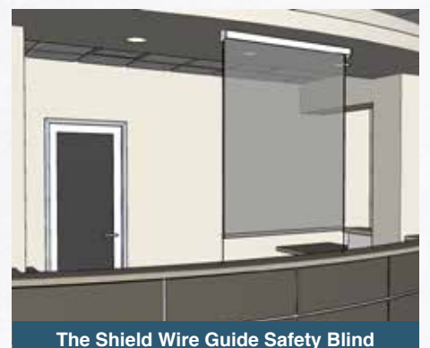
The Shield Wire Guide Safety Blind