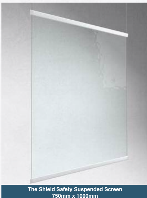
The Shield Safety Suspended Screen 750mm x 1000mm