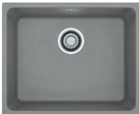
KUBUS KBG 110-50 STONE GREY Sink Dimensions: 540L x 440W Bowl Dimensions: 500L x 400W x 210D mm Product Code: 1250009