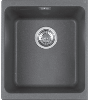
KUBUS KBG 110-34 ONYX Sink Dimensions: 380L x 440W mm Bowl Dimensions: 340L x 400W x 210D mm Product Code: 1250003

The Kubus KBG is an addition to the Franke undermount range. Manufactured from Fraganite in Onyx, Stone Grey and Polar White this sink is the perfect fit for any contemporary kitchen design.