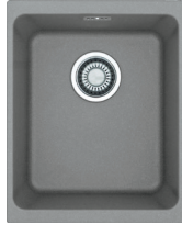
KUBUS KBG 110-34 STONE GREY Sink Dimensions: 380L x 440W mm Bowl Dimensions: 340L x 400W x 210D mm Product Code: 1250008