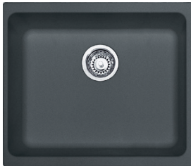
KUBUS KBG 110-50 ONYX Sink Dimensions: 540L x 440W Bowl Dimensions: 500L x 400W x 210D mm Product Code: 1250005