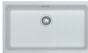
KUBUS KBG 110-70 POLAR WHITE Sink Dimensions: 802L x 460W mm Bowl Dimensions: 742L x 410W x 200D mm Product Code: 1250006