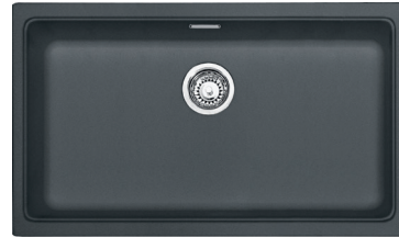
KUBUS KBG 110-70 ONYX Sink Dimensions: 802L x 460W mm Bowl Dimensions: 742L x 410W x 200D mm Product Code: 1250007