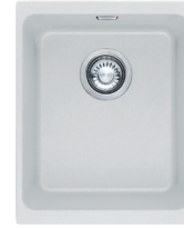
KUBUS KBG 110-34 POLAR WHITE Sink Dimensions: 380L x 440W mm Bowl Dimensions: 340L x 400W x 210D mm Product Code: 1250002