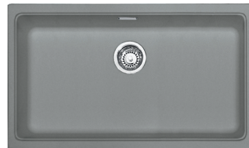
KUBUS KBG 110-70 STONE GREY Sink Dimensions: 802L x 460W mm Bowl Dimensions: 742L x 410W x 200D mm Product Code: 1990085