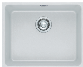
KUBUS KBG 110-50 POLAR WHITE Sink Dimensions: 540L x 440W Bowl Dimensions: 500L x 400W x 210D mm Product Code: 1250004