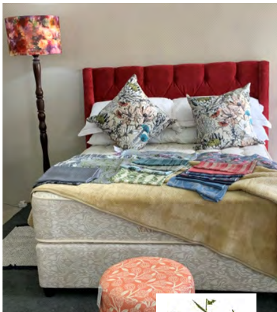
The showpiece from

So much to see – fabrics, leather, beds, bed linens, throws, blankets – and bubbly to top it all!