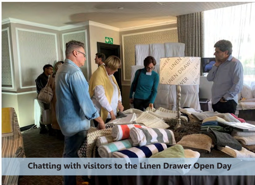
Chatting with visitors to the Linen Drawer Open Day