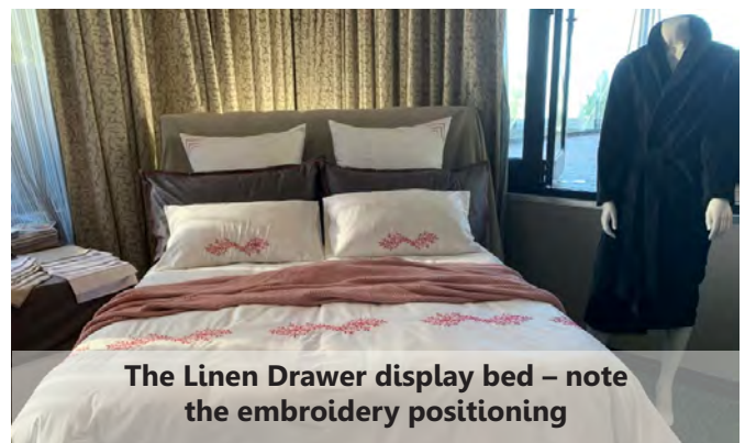
The Linen Drawer display bed - note the embroidery positioning