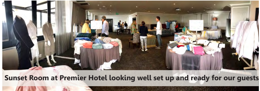
Sunset Room at Premier Hotel looking well set up and ready for our guests