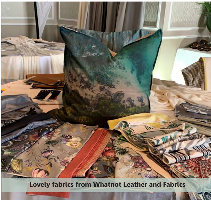
Lovely fabrics from Whatnot Leather and Fabrics