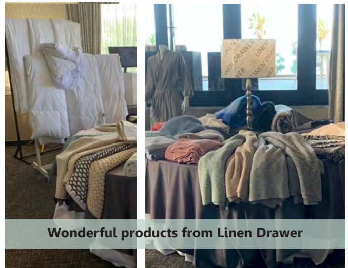
Wonderful products from Linen Drawer