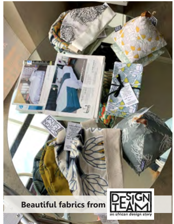
Beautiful fabrics from