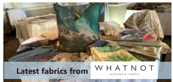
Latest fabrics from