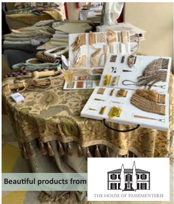
Beautiful products from