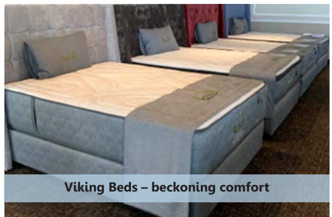
Viking Beds - beckoning comfort