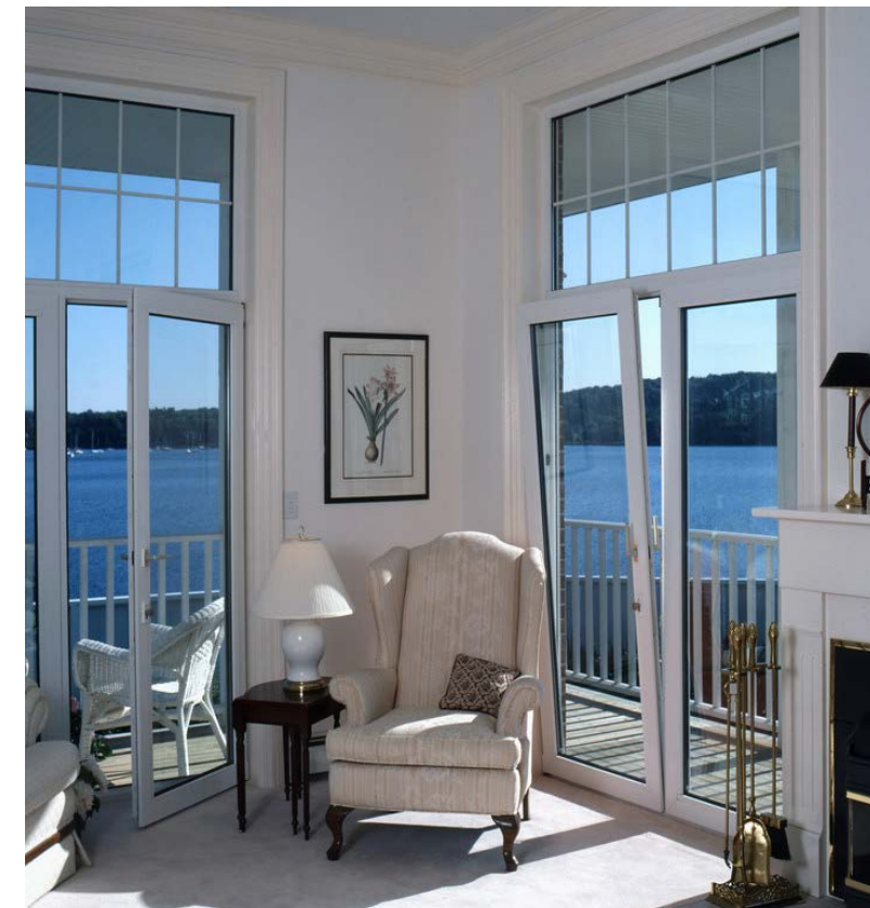
Tilt and Turn Door Options

Van Acht's uPVC doors are manufactured to suit customer requirements. A wide variety of options are available, such as: - French doors - Inline sliding doors - Stable doors