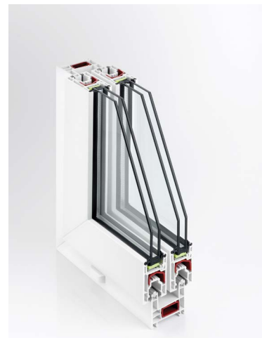
Double Glazed Sliding Window Cross Section

Sliding windows and doors are a perfect space-saving choice for new builds and retrofits.