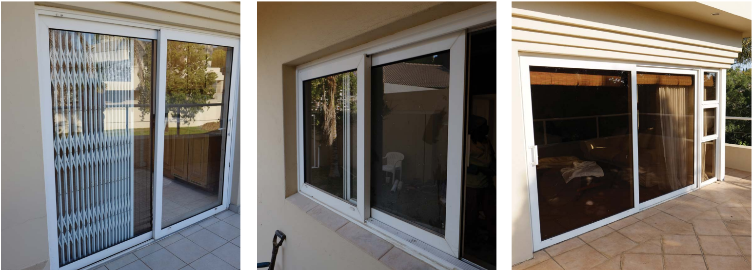
Rehau Windows and Doors installed in Fourways more than 20 years ago, still in perfect working condition, no fading or discoloration of profiles.

Rehau profiles have a life expectancy of 40+ years and all of our products come with a 10 year international guarantee.