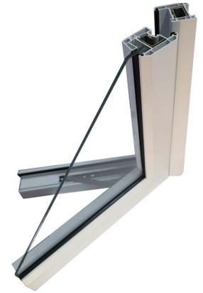
Eco Tech Cross Section Single Glazed

Casement windows are available with either single or double glazing. Over and above the many aesthetic features available, casement windows manufactured from REHAU profile can accommodate the very latest high performance handles, hinges and locking mechanisms, to make your casement windows safe and secure.