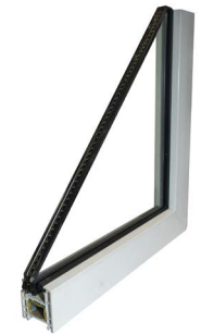
Eco Tech Cross Section Double Glazed