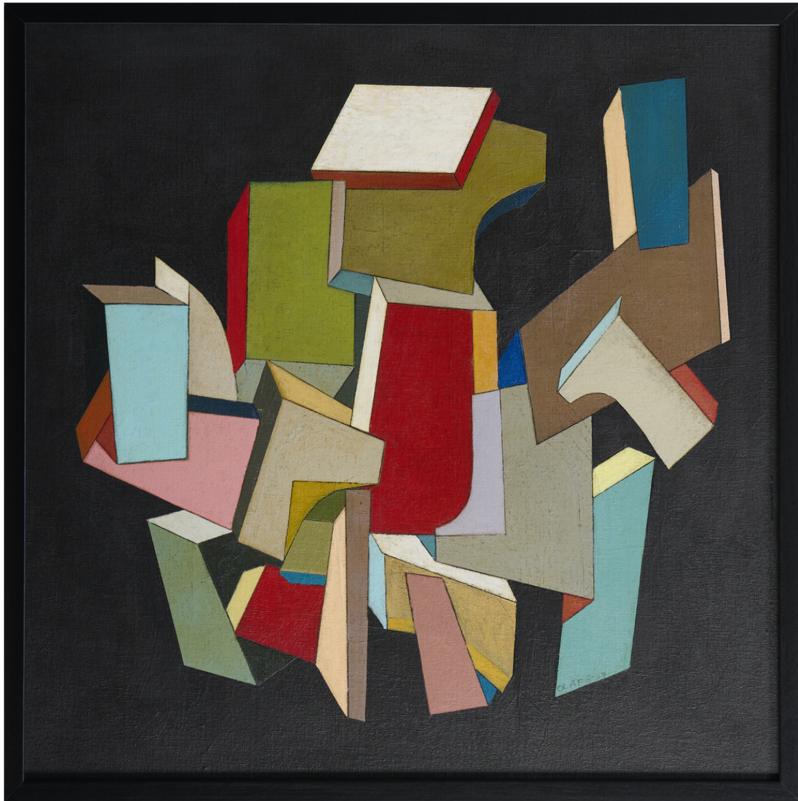
OLAF BISSCHOFF Impossible Architecture 4 , 2023 Oil on board 48.5 x 48.5 cm Framed: 52 x 52 cm R 18,500