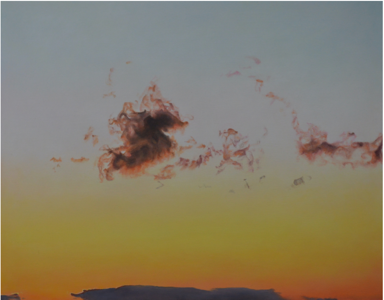
CATHERINE OCHOLLA Nebulae II , 2023 Oil on wooden panel 42.4 x 52.5 cm R 16,000