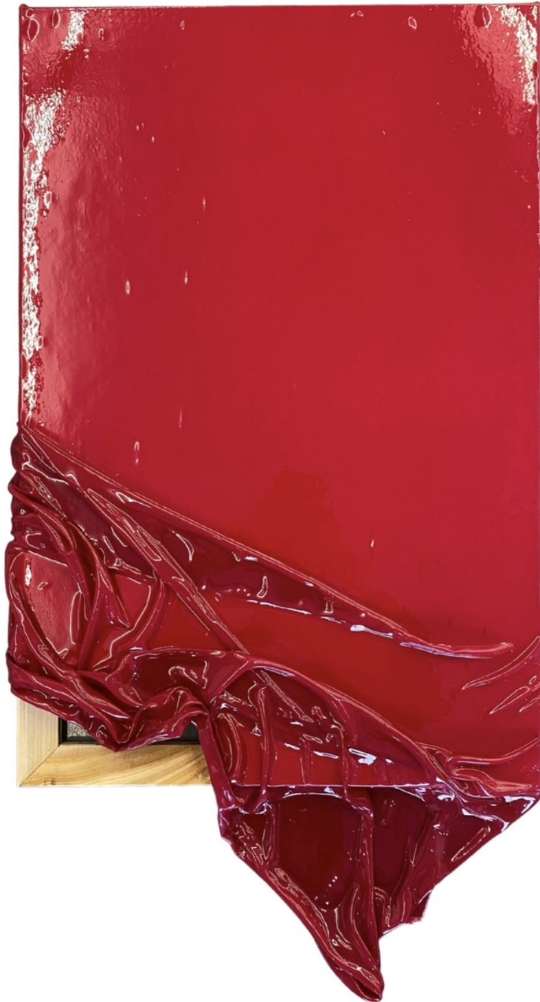
ANEESAH GIRIE RED , 2022 Scarf fabric clear lacquer and wood glue on canvas 118 x 60 cm R 20,000