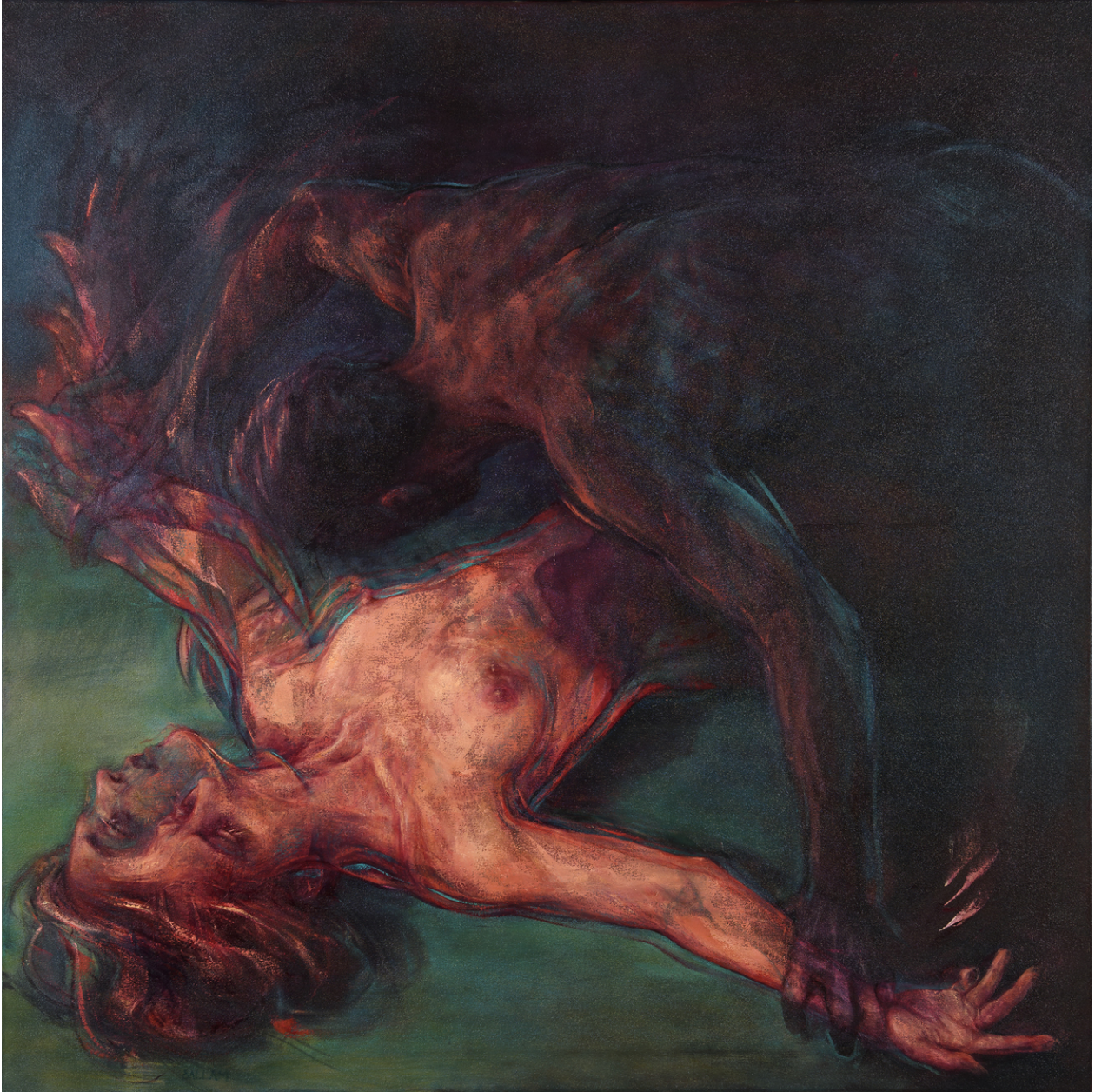
SARAH BALLAM Untitled , 2022 Oil on canvas 120 x 120 cm R 85,000