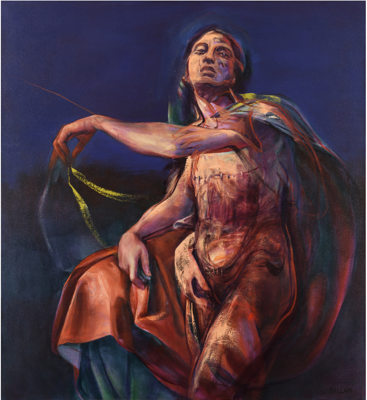
SARAH BALLAM Sybil , 2022 Oil on canvas 120 x 110 cm R 70,000