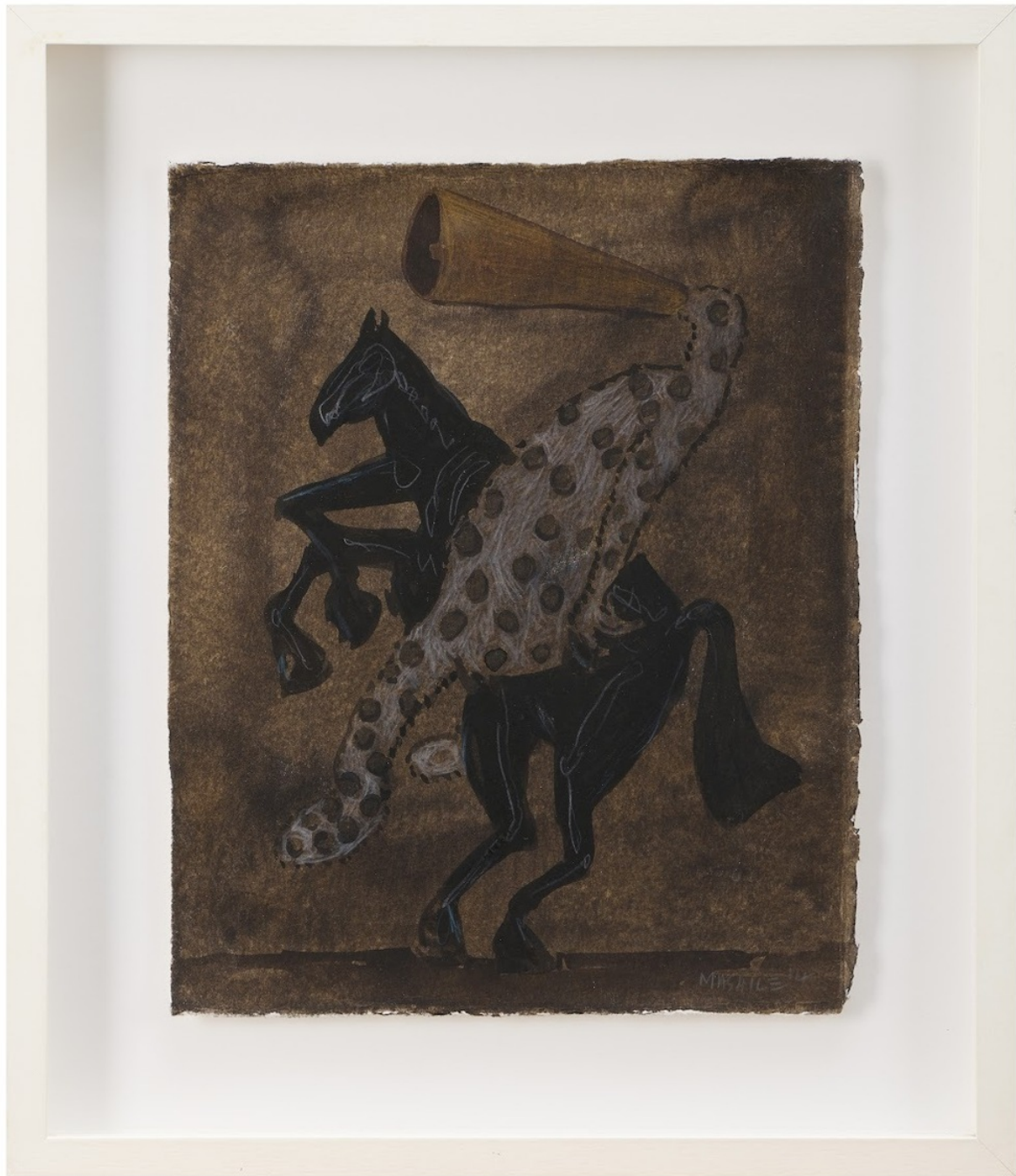
COLBERT MASHILE New Artwork 29.5 x 24 cm Framed: 41 x 32.5 cm