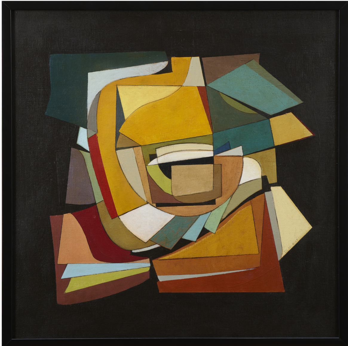
OLAF BISSCHOFF Impossible Architecture 2 , 2023 Oil on board 48.5 x 48.5 cm Framed: 52 x 52 cm R 18,500