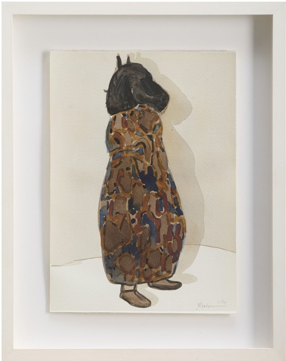
COLBERT MASHILE New Artwork 29.5 x 21 cm Framed: 41 x 32.5 cm