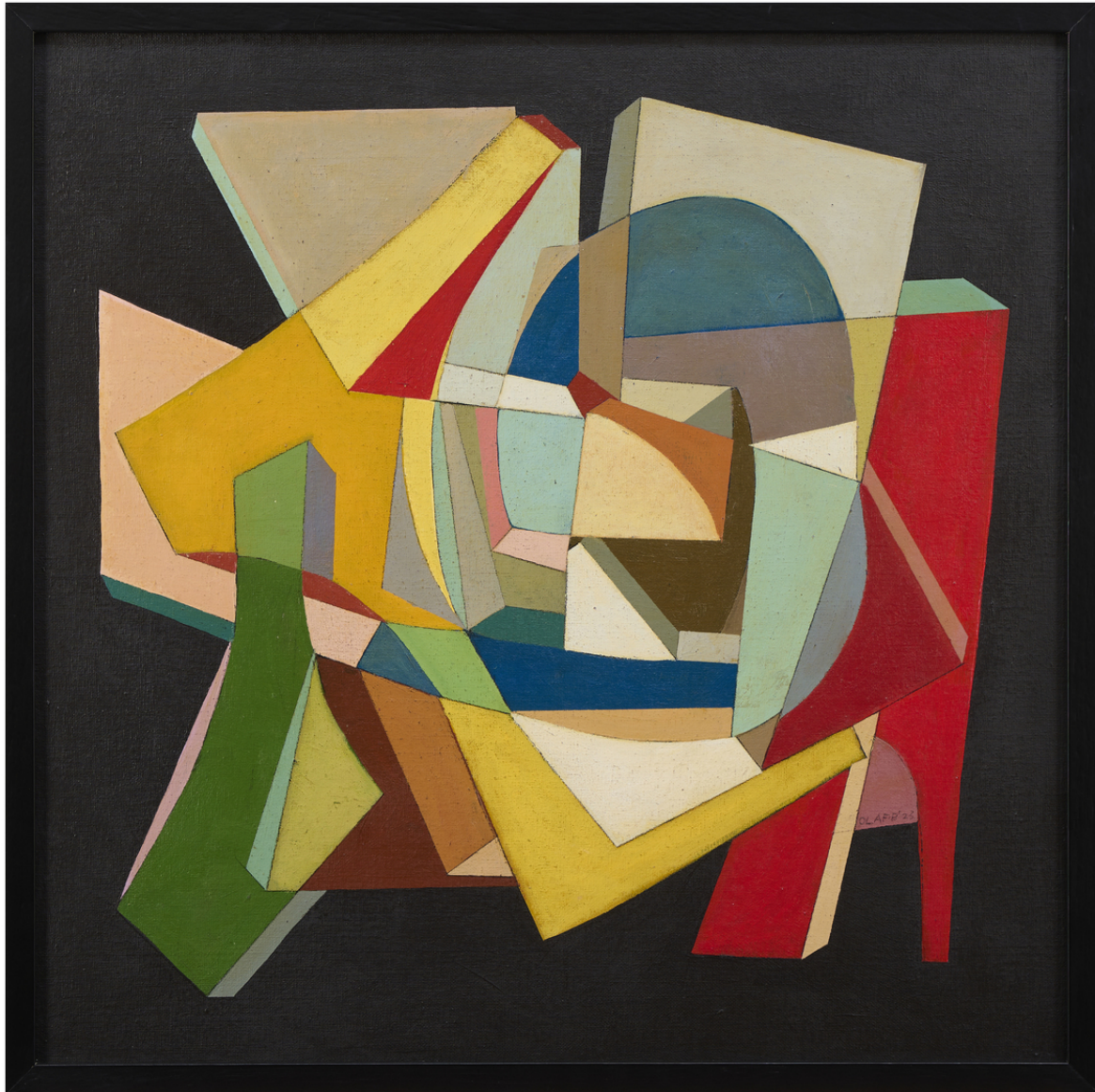
OLAF BISSCHOFF Impossible Architecture 3 , 2023 Oil on board 48.5 x 48.5 cm Framed: 52 x 52 cm R 18,500