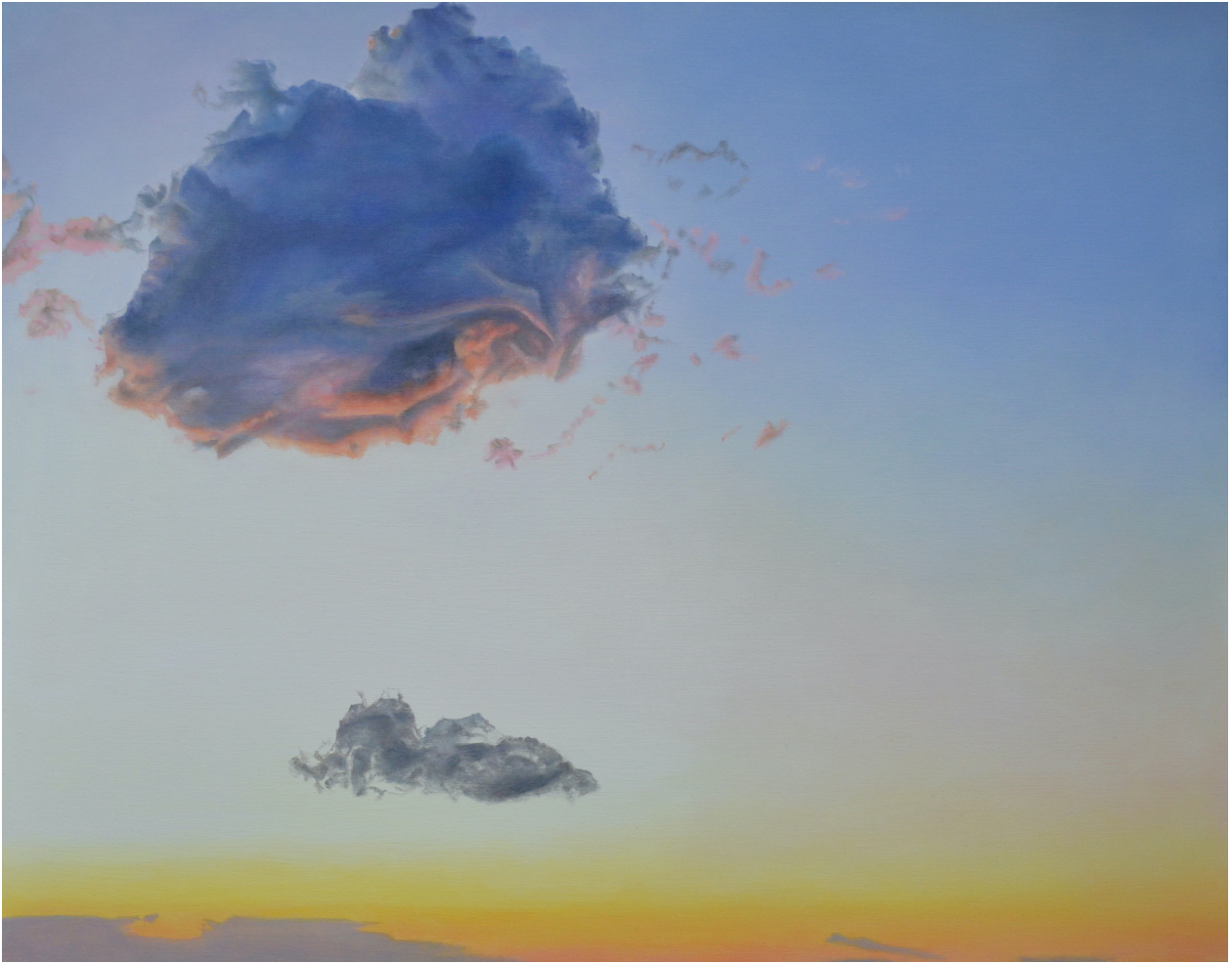
CATHERINE OCHOLLA Nebulae I , 2023 Oil on wooden panel 42.4 x 53.5 cm R 16,000