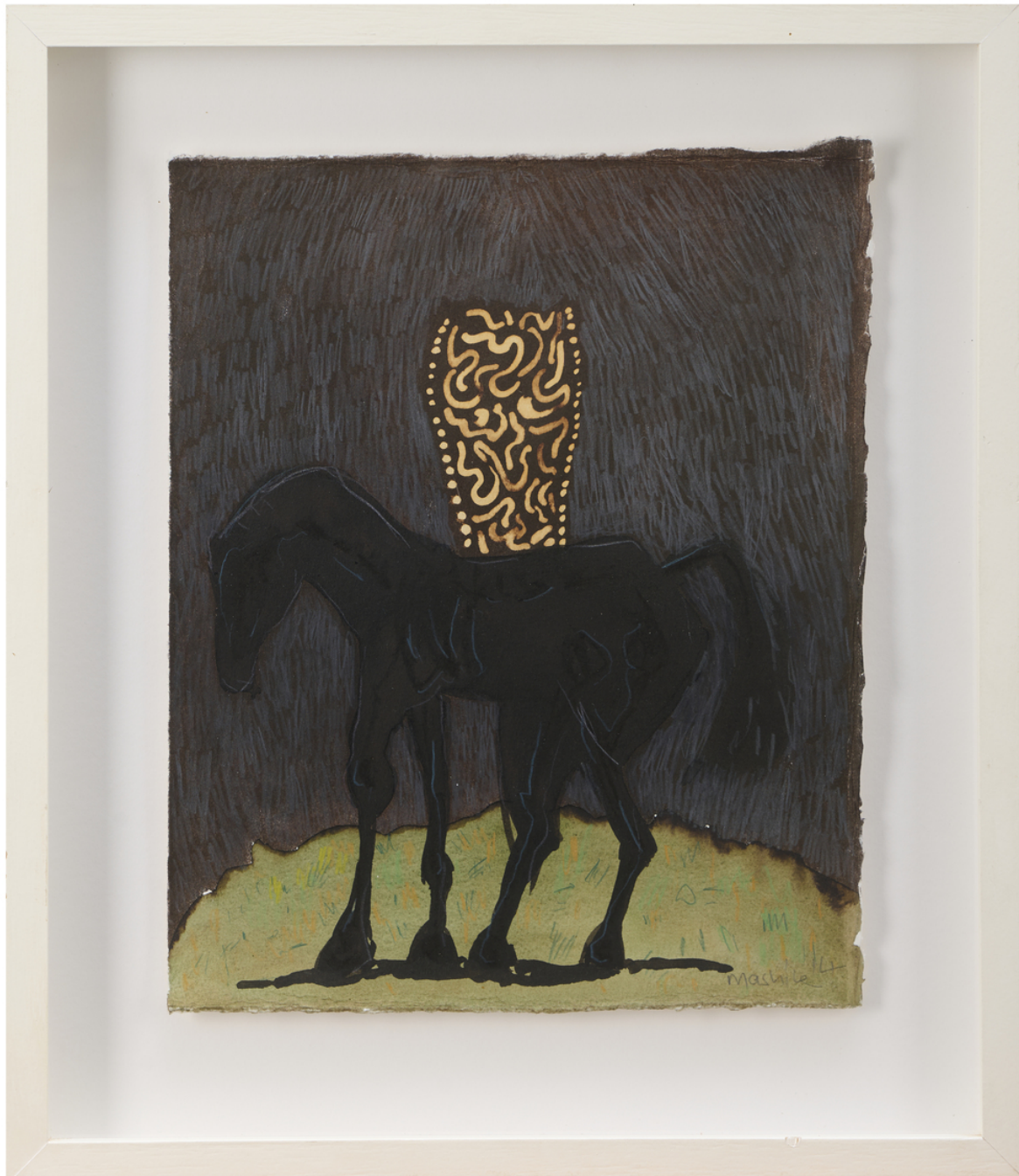
COLBERT MASHILE New Artwork 29.5 x 24 cm Framed: 41 x 35.5 cm