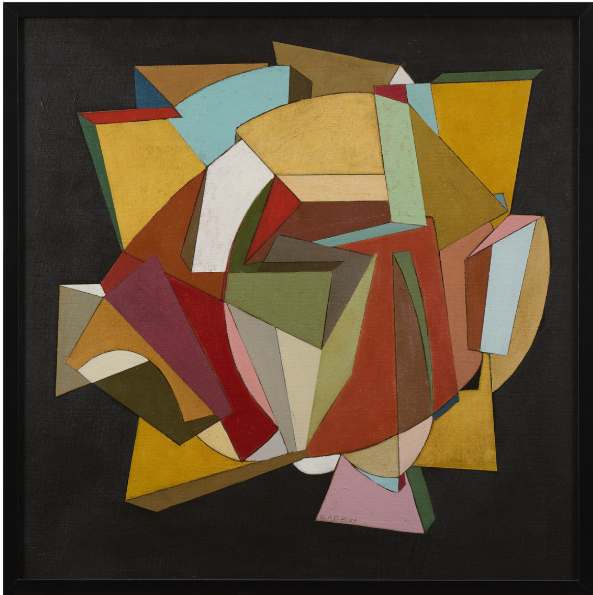
OLAF BISSCHOFF Impossible Architecture 1 , 2023 Oil on board 48.5 x 48.5 cm Framed: 52 x 52 cm R 18,500