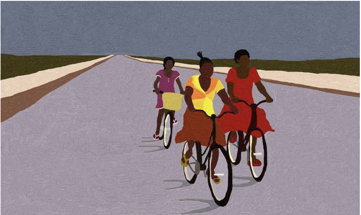
NTATE PHAKELA Mansau Highway , 2023 Fine Art Print on Ilford Textured Silk Paper 42 x 59.4 cm Framed: 57 x 77 cm R 12,000