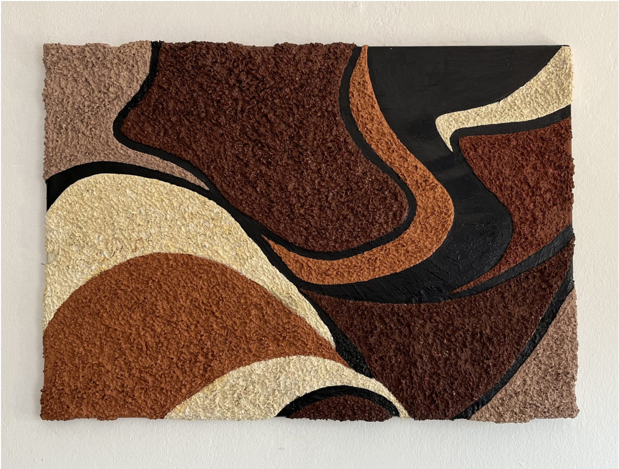
ANDISWA BHUNGANE Thandiwe , 2023 Mixed media 59.4 x 84.1 cm R 7,500