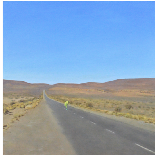
CATHERINE OCHOLLA Energize , 2022 Oil on board Framed: 74 x 38 x 3 cm R 20,000