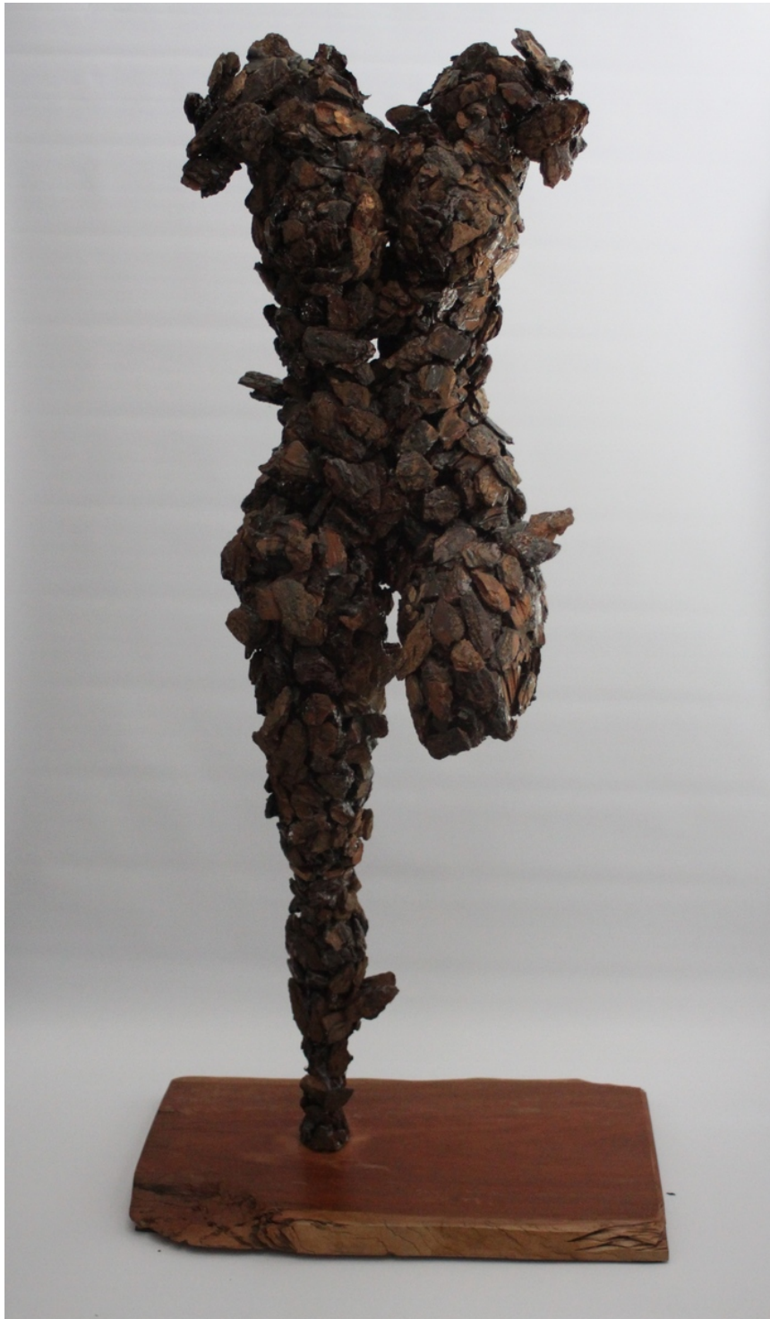
FATHEMA BEMATH Armis , 2022 Bark chip and resin 156 x 73 x 44 cm R 100,000