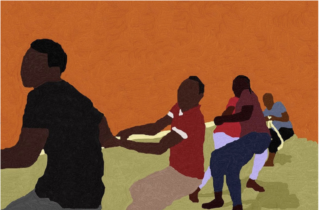
NTATE PHAKELA Madonsana , 2023 Fine Art Print on Ilford Textured Silk Paper 42 x 59.4 cm Framed: 6857 x 77 cm R 12,000