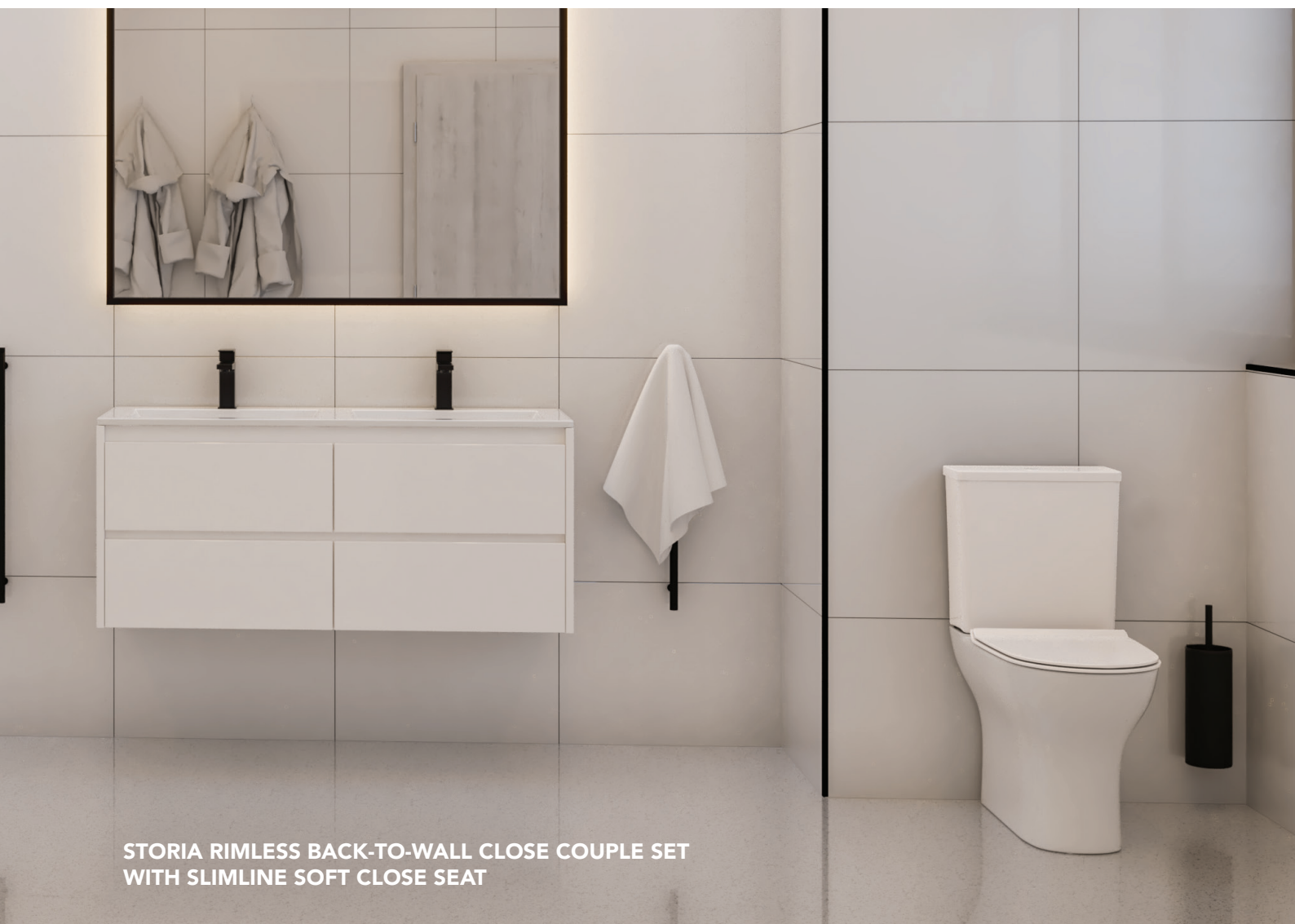
STORIA RIMLESS BACK-TO-WALL CLOSE COUPLE SET WITH SLIMLINE SOFT CLOSE SEAT