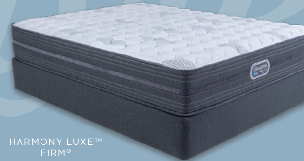
HARMONY LUXE™ FIRM®