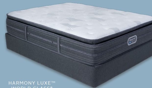
HARMONY LUXE™ WORLD CLASS®