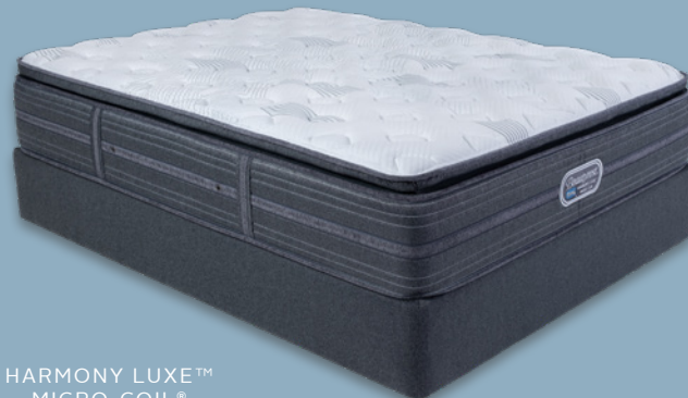
HARMONY LUXE™ MICRO-COIL®