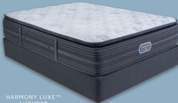
HARMONY LUXE™ LUXURY®