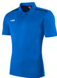
Royal/Navy Junior: 302495 Adult: 302494