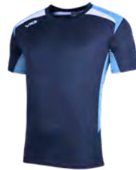
Navy/Sky/White Junior: 90406 Adult: 90414