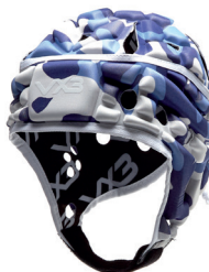
Navy/Sky/White Adult: AIRF001