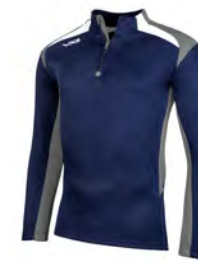
Navy/Dark Grey/White Junior: 91469 Adult: 91470