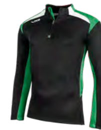
Black/Emerald/White Junior: 90540 Adult: 90548