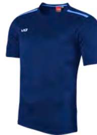
Navy/Sky Junior: 302458 Adult: 302457