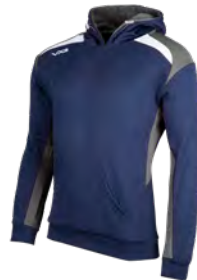
Navy/Dark Grey/White Junior: 91467 Adult: 91468