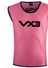
Bib Pink Available in Adult, Youth, Youth: 63032