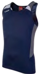
Navy/Dark Grey/White Adult: 90399