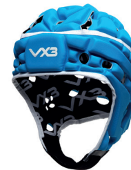
Sky/White/Black Youth: AIRF014 Adult: AIRF006