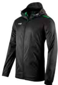
Black/Emerald Junior: 302403 Adult: 302402