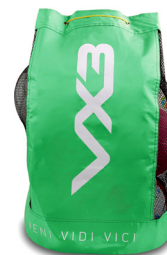
Ball Carrier Green Code: 66690