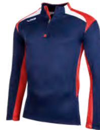
Navy/Red/White Junior: 91441 Adult: 91442