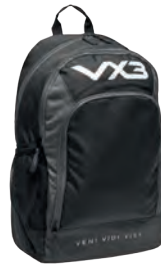
Backpack Black/Grey Code: 60750

With several zipped compartments for organising your belongings our backpacks and kitbags are the perfect items to use to carry your kit or essentials. Made from 100% polyester material, VX3 element proof technology ensures the fabric is water resistant so you can keep the contents inside dry. The adjustable shoulder straps allow for carrying of heavier loads and come with padding to keep the wearer comfortable without overheating. Mesh pockets and sleeves allow for storing of various items.