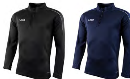
Black/Charcoal/White Adult: 92334

The essential warm up and travel garment. The Pro Half Zip Sweat is the track top alternative of choice for the modern athlete. Crafted in a super soft 100% Polyester durable brushed back fleece guaranteed to keep you insulated. Updated details and styling and the high count micro yarn ensures an elevated high quality finish. The zipped neck design, self-fabric cuff and open hem combined with the athletic fit and high performance fabric ensures a professional look both on and off the training ground whilst keeping you warm and dry.