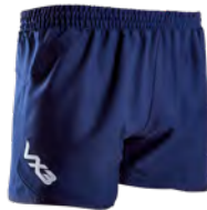
Navy Junior: 48646 Adult: 91425