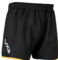
Black/Amber Junior: 48642 Adult: 91421