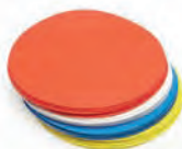
Rubber Agility Dots Code: 63049