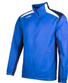
Royal/Navy/White Junior: 91479 Adult: 91480