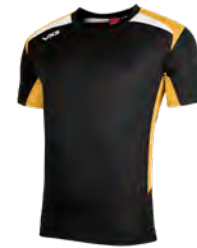
Black/Amber/White Junior: 90403 Adult: 90411