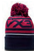
Navy/Pink/White Code: 96960