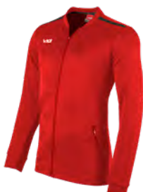
Red/Black Junior: 302484 Adult: 302483