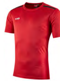
Red/Black Junior: 302486 Adult: 302485