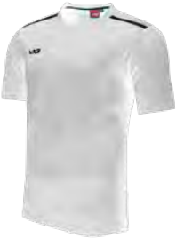
White/Black Junior: 302517 Adult: 302516