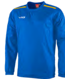
Royal/Yellow Junior: 303505 Adult: 303496