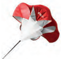
Speed Chute Red Code: 63064