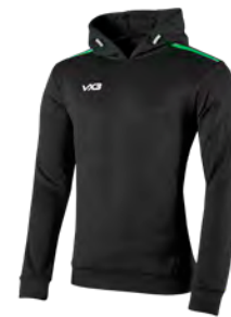
Black/Emerald Junior: 302405 Adult: 302404