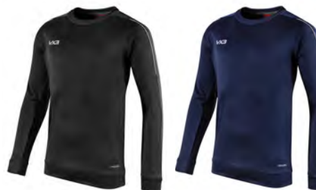
Black/Charcoal/White Adult: 92336

An updated classic. The Pro Crew sweat is crafted in a super soft 100% Polyester durable brushed back fleece guaranteed to keep you insulated. Modern details and styling and the high count micro yarn ensures an elevated high quality finish. The ribbed crew neck design, self-fabric cuff and open hem combined with the athletic fit and high performance fabric ensures a professional look both on and off the training ground whilst keeping you warm and dry.