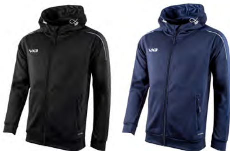
Black/Charcoal/White Adult: 92332

Designed with multi-layering in mind the Pro Full Zip Hoodie allows multi-purpose usage as a mid-weight fleece backed outer layer or when required can be paired with the Pro Crew Sweat and Pro Gilet for ultimate warmth on winter training sessions. Two zipped secured pockets keep your valuables safe and the funnel neck hood with stretch drawcord, sports toggles and contrast liner ensure further protection from the elements. The athletic fit and premium fabric and details ensure a professional finish.