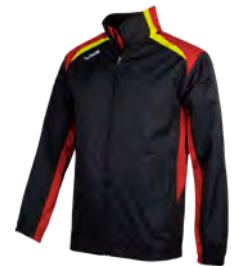
Black/Red/Amber Junior: 288909 Adult: 288908