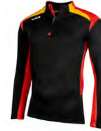
Black/Red/Amber Junior: 288907 Adult: 288906