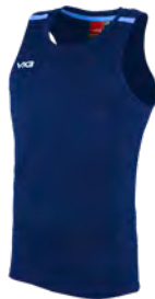
Navy/Sky Adult: 302459