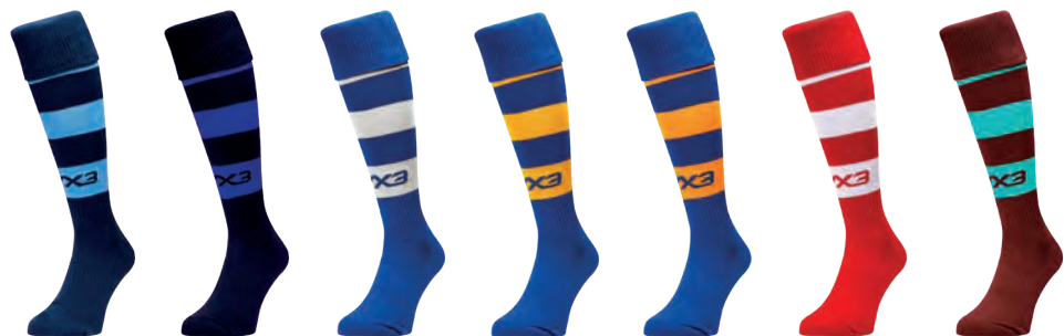
Navy/Sky Navy/Royal Royal/White Royal/Yellow Royal/Amber Red/White Burgundy/Sky Youth: 92290 Youth: 92304 Youth: 92292 Youth: 92294 Youth: 92302 Youth: 92296 Youth: 92298 Adult: 92291 Adult: 92305 Adult: 92293 Adult: 92295 Adult: 92303 Adult: 92297 Adult: 92299