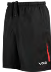
Black/Red Junior: 302428 Adult: 302427

Designed for comfort and unrestricted movement in a classic athletic design. The Fortis Short is available in a comprehensive range of club colours. The soft handle 100% Polyester fabric is incredibly quick drying and the breathable anti-cling woven fabric ensures it keeps you cool. The subtle high-performance silicone detailing and branding combined with a contoured fit ensures you look and feel your best for summer training and intense gym workouts.