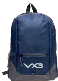
Backpack Navy Code: 60753

With zipped compartments for organising your belongings our backpacks and kitbags are the perfect items to use to carry your kit or essentials. Made from 100% polyester material, VX3 element proof technology ensures the fabric is water resistant so you can keep the contents inside dry. The adjustable shoulder straps allow for carrying of heavier loads and come with padding to keep the wearer comfortable without overheating.