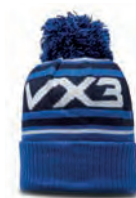
Royal/Navy/White Code: 62844