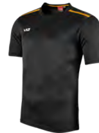
Black/Amber Junior: 302400 Adult: 302399