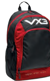
Backpack Black/Red Code: 60751