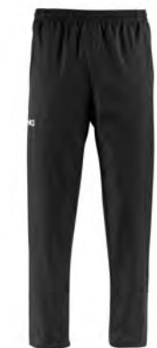
Black Track Pant Junior: 91431 Adult: 91432