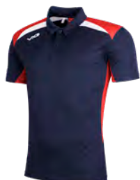
Navy/Red/White Junior: 91444 Adult: 91445