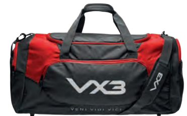
Kit Bag Black/Red Code: 60758