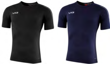
Black/Charcoal/White Adult: 92326

Developed with our Pro club partners. The Pro tee is a performance garment specially formulated to retain all the comfort of natural cotton and the performance of Polyester. Features include the VENA-COOL vapour management system to help wick sweat away from the body when the wearer is in an intense workout and features an athletic fit and superfine interlock knit for durability and added comfort.