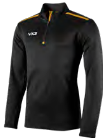
Black/Amber Junior: 302392 Adult: 302391