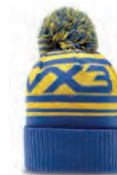
Royal/Yellow Code: 344739