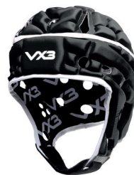
Black/White Youth: AIRF012 Adult: AIRF002