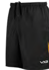
Black/Amber Junior: 302398 Adult: 302397