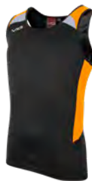
Black/Amber/White Adult: 90397