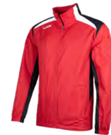
Red/Black/White Junior: 90455 Adult: 90463