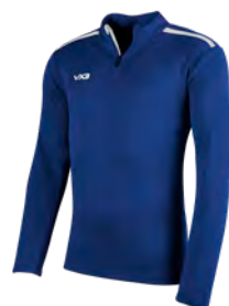
Navy/White Junior: 302465 Adult: 302464