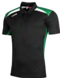
Black/Emerald/White Junior: 90420 Adult: 90428