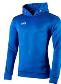
Royal/Navy Junior: 302491 Adult: 302490