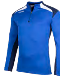
Royal/Navy/White Junior: 90544 Adult: 90552