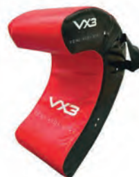
Ruck N Roll Contact Shield Youth: 45086 Adult: 45087