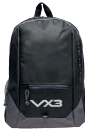
Backpack Black/Grey Code: 60752