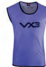
Bib Purple Available in Adult, Youth, Youth: 66683