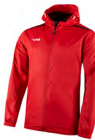
Red/Black Junior: 302476 Adult: 302475