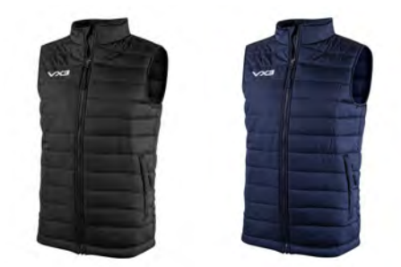
Black Adult: 92348 Ladies: 92349

Developed to meet the exacting requirements of our top level Pro club partners. The Pro Gilet offers a highly versatile solution to your training wear. The soft handle rip-stop outer shell is tough and lightweight with a windproof, shower resistant finish. Full quilting throughout combined with the high funnel neck design and micro fleece lined handwarmer pockets offers unrivalled insulation. The Curved back hem with concealed elasticated drawcord system and sports toggles ensure the perfect outer wear layer.