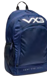
Backpack Navy Code: 60749