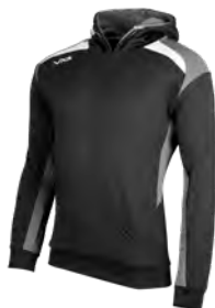
Black/Dark Grey/White Junior: 90433 Adult: 90441