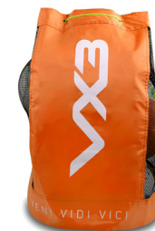
Ball Carrier Orange Code: 66691