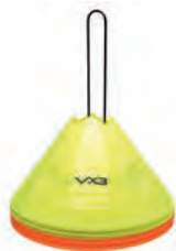
Speed Dome Markers Code: 63058

We stock a huge range of different training and development products, all of which are designed to enhance a specific aspect of the user's performance. Our training equipment range caters for people of all ages, abilities, experience levels and sports, ensuring that it meets the requirements of all our customers.