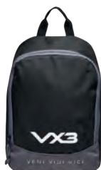
Boot Bag Black/Grey Code: 60767