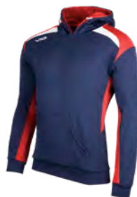
Navy/Red/White Junior: 91439 Adult: 91440