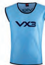
Bib Sky Available in Adult, Youth, Youth: 63029