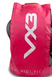
Ball Carrier Pink Code: 66692