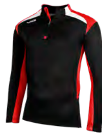
Black/Red/White Junior: 90546 Adult: 90538

The perfect option for training and warming up in cooler conditions or travelling to and from the game. The brushed back 100% Polyester fleece fabric offers warmth and comfort and ensures wicking. The Novus Half Zip Sweat offers a modern smart alternative to the hoodie.