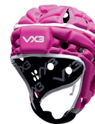
Pink/White/Black Adult: 66346