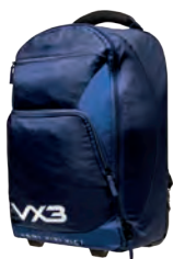
Cabin Bag Navy Code: 60766