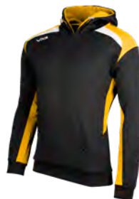
Black/Amber/White Junior: 90435 Adult: 90443