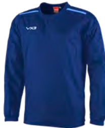
Navy/Sky Junior: 303501 Adult: 303492