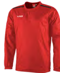
Red/Black Junior: 303503 Adult: 303494