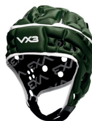
Bottle Green/White Adult: AIRF009