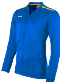
Royal/Yellow Junior: 302510 Adult: 302509