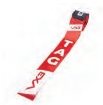
Tag Rugby Belt Red Code: 66688