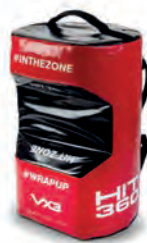
HIT 360 Round back Contact Shield Code: 64909