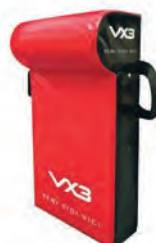
Single Wedge Youth: 45089 Mini: 45088