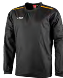
Black/Amber Junior: 303497 Adult: 303488