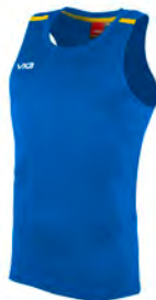
Royal/Yellow Adult: 302513