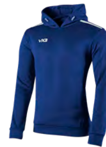
Navy/White Junior: 302463 Adult: 302462