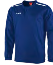
Navy/White Junior: 303502 Adult: 303493