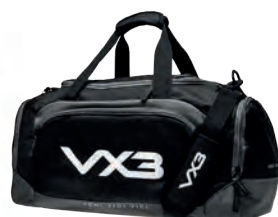
Kit Bag Black/Grey Code: 60759