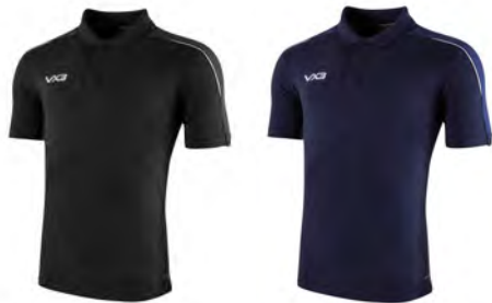
Black/Charcoal/White Adult: 92328

The ultimate club polo. The Pro polo comes in a fine knit Cotton Poly blend and features the VENA-COOL vapour management system and athletic fit. The breathable 60/40 Cotton/Poly performance pique fabric keeps you dry and comfortable whilst the classic knitted ribbed collar and semi ribbed cuff offer a smarter alternative for travel and presentation.