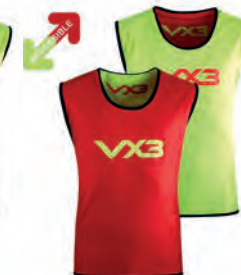
Reversible Bib Red Available in Adult, Youth, Youth: 63046