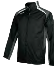
Black/Dark Grey/White Junior: 90449 Adult: 90457