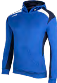
Royal/Navy/White Junior: 90440 Adult: 90448