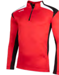
Red/Black/White Junior: 90538 Adult: 90546