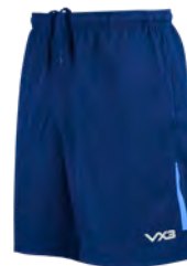
Navy/Sky Junior: 383595 Adult: 383594