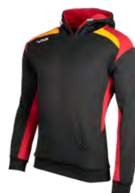
Black/Red/Amber Junior: 288905 Adult: 288904