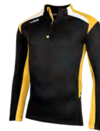
Black/Amber/White Junior: 90539 Adult: 90547