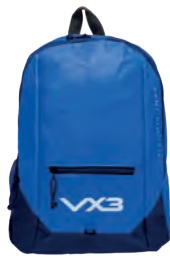
Backpack Royal Code: 60755