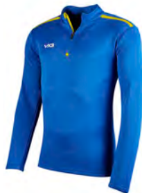
Royal/Yellow Junior: 302506 Adult: 302505