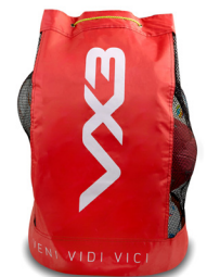
Ball Carrier Red Code: 66693