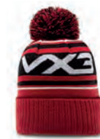
Red/Black/White Code: 344738