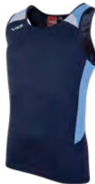
Navy/Sky/White Adult: 90400