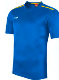
Royal/Yellow Junior: 302512 Adult: 302511