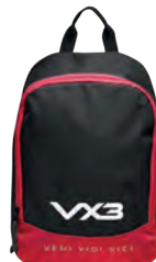
Boot Bag Black/Red Code: 60769