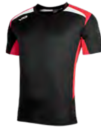
Black/Red/White Junior: 90402 Adult: 90410

A dedicated high-performance Tech Tee in a vast range of club specific colours. The Novus Tee is a great all- round option for warming up, hitting the gym or relaxing after the game. The soft handle 100% Polyester fabric is incredibly quick drying and the breathable anti-cling Micro Dot knit ensures it keeps you cool. The ergonomic saddle shaped shoulder and up to the minute styling ensures you look and feel great.