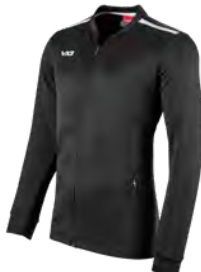
Black/White Junior: 302441 Adult: 302440