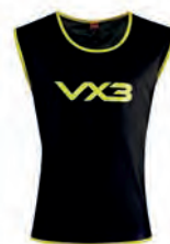
Bib Black Available in Adult, Youth, Youth: 66682

The lightweight mesh design of our bibs ensure a comfortable fit, whilst the bright colours means that teams can easily be recognised whilst our bib bags have been crafted with a drawstring fastening to the top to keep all the bibs secure and finished in a bold colour to match.