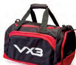
Kit Bag Black/Red Code: 60761