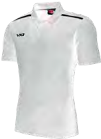
White/Black Junior: 302517 Adult: 302514