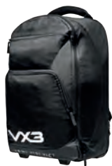
Cabin Bag Black Code: 60765

Our durable wheel along luggage bags come in two handy sizes; cabin or trolley sized. With several zipped compartments for organising your belongings our bags are the perfect items to use to carry your kit or essentials. To make holding, carrying or lifting easier these bags come with a handle on the top and two back straps. They have been crafted from tough, durable fabric so they last longer and withstand the pressure of lengthier journeys without being damaged in transit.