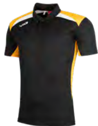
Black/Amber/White Junior: 90419 Adult: 90427