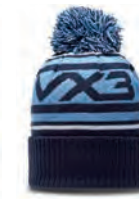
Navy/Sky/White Code: 62837