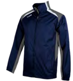
Navy/Dark Grey/White Junior: 91465 Adult: 91466