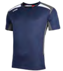
Navy/Dark Grey/White Junior: 90405 Adult: 90413