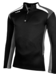
Black/Dark Grey/White Junior: 90537 Adult: 90545