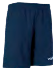
Leisure Short Navy Junior: 91437 Adult: 45646