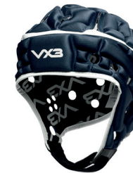
Navy/White/Black Adult: AIRF007