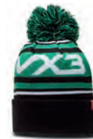
Black/Emerald/White Code: 62846