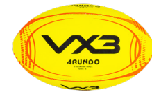
Arundo Ball Sizes 3, 4 & 5 Fluoro Code: ARUN04