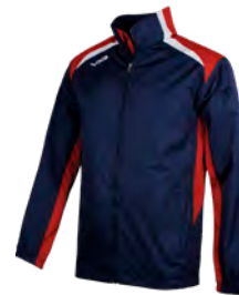
Navy/Red/White Junior: 48325 Adult: 48324