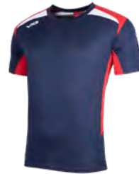
Navy/Red/White Junior: 91446 Adult: 91447