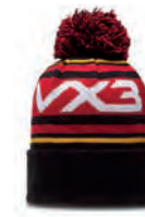
Black/Red/Amber Code: 62836