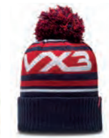
Navy/Red/White Code: 62845