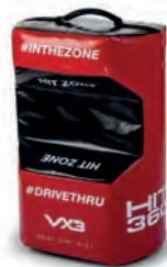
HIT 360 Flat back Contact Shield Code: 64910