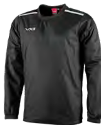
Black/White Junior: 303500 Adult: 303491