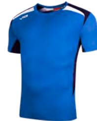
Royal/Navy/White Junior: 90408 Adult: 90416