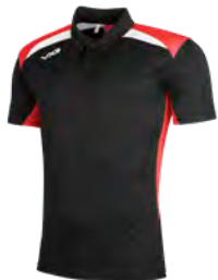
Black/Red/White Junior: 90418 Adult: 90426

Great for any occasion The Novus Polo offers a slightly smarter option in your club colours for travel wear and presentation wear. A firm favourite of coaches and sports masters alike the durable Poly Pique fabric offers unrivalled comfort and durability. Perfect for sport, perfect for representing your club or association.