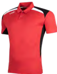
Red/Black/White Junior: 90423 Adult: 90431