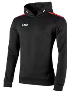
Black/Red Junior: 302420 Adult: 302419

An updated wardrobe staple. The Fortis Hoodie offers a modern take on the classic overhead layer. The super soft brushed back 100% Polyester fleece fabric offers warmth and comfort and ensures wicking. Features include a pouch pocket, adjustable hood with stretch drawcord and sports toggles for safety. The subtle high-performance silicone detailing and branding combined with a contoured performance fit offers a practical and versatile training favourite.