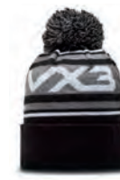
Black/Grey/White Code: 62843