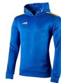
Royal/Yellow Junior: 302504 Adult: 302503