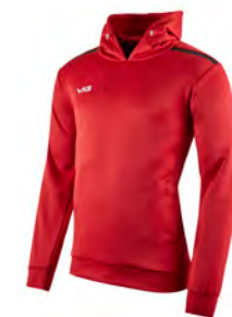
Red/Black Junior: 302478 Adult: 302477