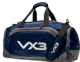
Kit Bag Navy/Grey Code: 60760