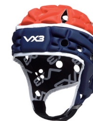
Navy/Orange/White Adult: AIRF011