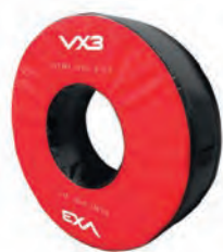
Roller Tackle Bag Youth: 45098 Adult: 45100

The design of our pads and bags make for an innovative way to improve technique whilst ensuring player safety. Fully reinforced with thick padding to limit injury whilst practising proper technique, there's no holding back in training, have full confidence whilst learning the basics.