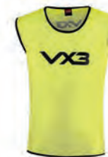
Bib Yellow Available in Adult, Youth, Youth: 63034