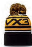
Black/Amber/White Code: 62838