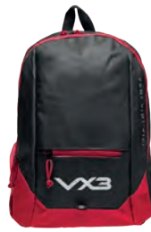
Backpack Black/Red Code: 60754