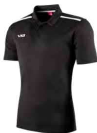
Black/White Junior: 302439 Adult: 302438