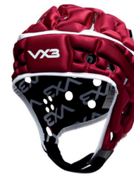
Maroon/White/Black Adult: AIRF005