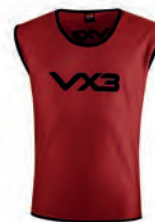
Bib Red Available in Adult, Youth, Youth: 63033