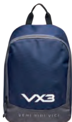
Boot Bag Navy Code: 60768