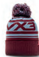
Burgundy/Sky Code: 344740