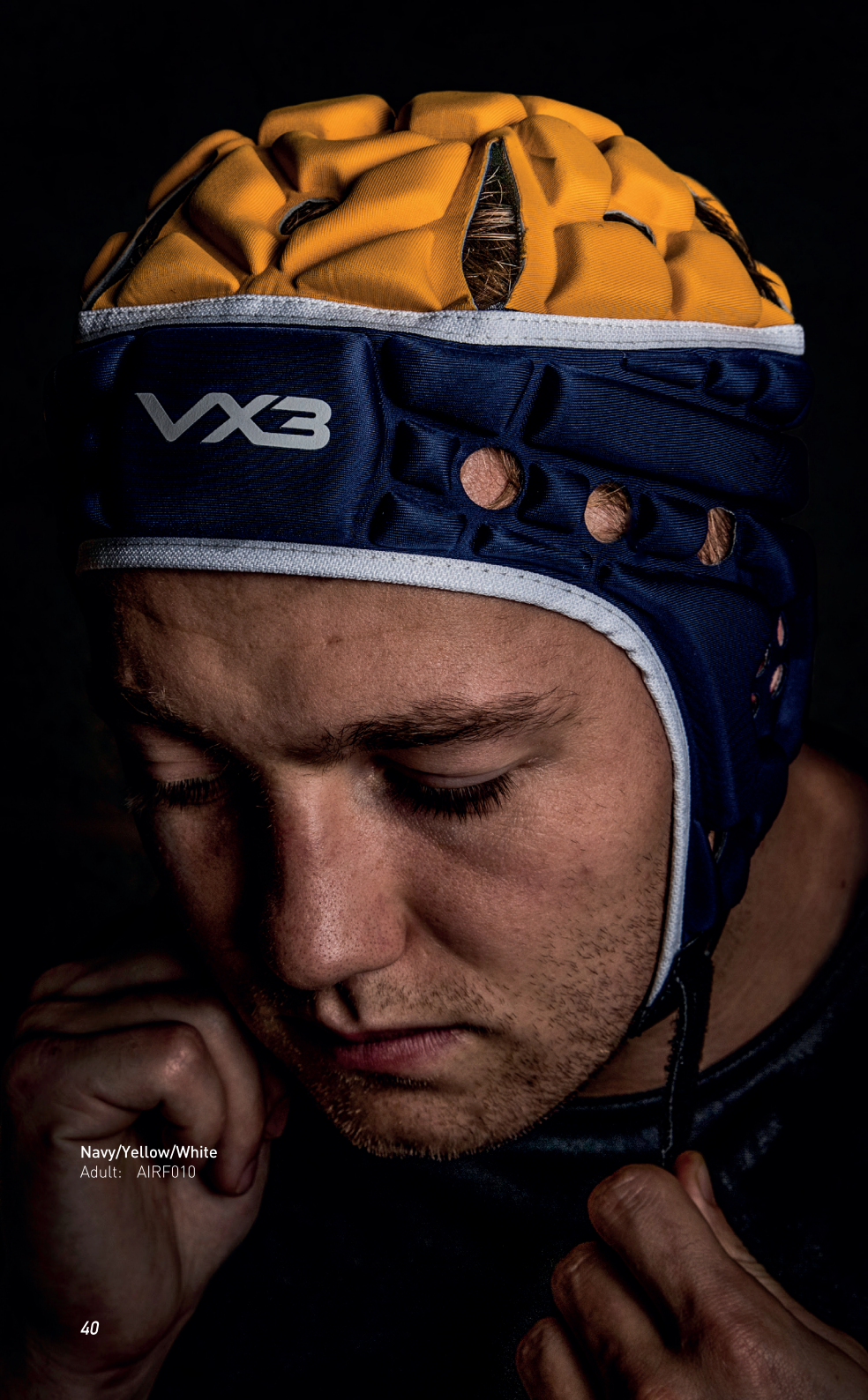
Navy/Yellow/White Adult: AIRF010