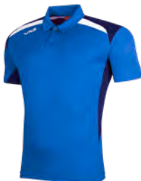
Royal/Navy/White Junior: 90424 Adult: 90432