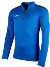
Royal/Navy Junior: 302493 Adult: 302492