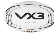
Ballisto Ball Size 5 Black Code: BALL01