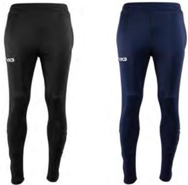
Black Junior: 92597 Adult: 95746

The optimum in performance and function. The Pro skinny pant is produced in a durable, soft handle knitted Polyester fabric. The elasticated drawcord waist, mechanical stretch and articulated seams offer the perfect fit whilst two zipped secured pockets ensure you can store valuables safely and the knee to hem zip ensures easy on - off when you need to cool down. A sleek and modern alternative the track pant creating up to the minute styling in a clean contemporary design.