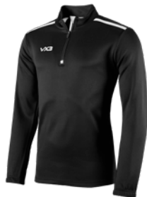
Black/White Junior: 302437 Adult: 302436