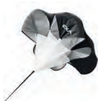
Speed Chute Black Code: 63063