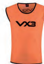
Bib Orange Available in Adult, Youth, Youth: 63031