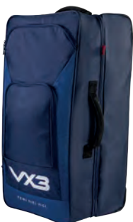
Trolley Bag Navy Code: 60763