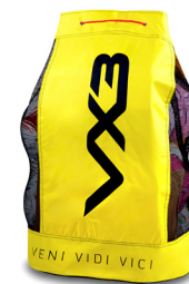
Ball Carrier Yellow Code: 66694