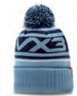
Sky/Navy/White Code: 344743