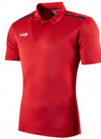
Red/Black Junior: 302482 Adult: 302481