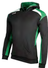
Black/Emerald/White Junior: 90436 Adult: 90444