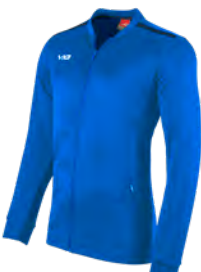
Royal/Navy Junior: 302497 Adult: 302496