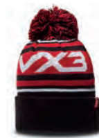
Black/Red/White Code: 62847

The lightweight fabric of our bobble hats provide superior warmth and comfort whilst the material wicks sweat away from the wearer whilst drying really fast.