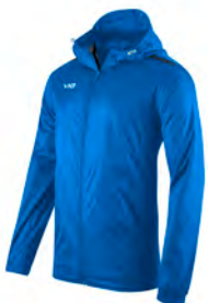
Royal/Navy Junior: 302489 Adult: 302488