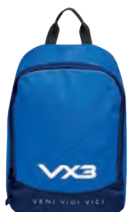
Boot Bag Royal Code: 60770