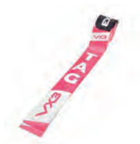
Tag Rugby Belt Pink Code: 66687