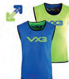
Reversible Bib Blue Available in Adult, Youth, Youth: 63035