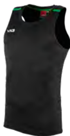
Black/Emerald Adult: 302416