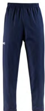
Navy Track Pant Junior: 91433 Adult: 91434