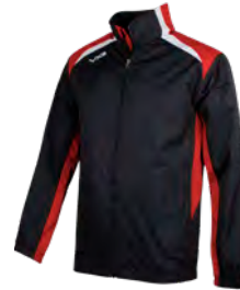
Black/Red/White Junior: 90450 Adult: 90458

The durable rip-stop shell features a water resistant coating and laminate backing to ensure The Novus Full Zip Jacket is both windproof and water resistant whilst remaining lightweight and breathable. The features include zipped secured pockets, a warm mesh lining which keeps you insulated and a concealed fully functional hood to offer further protection from the elements.