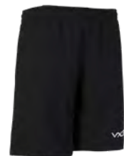
Leisure Short Black Junior: 91435 Adult: 45647