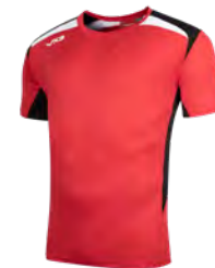
Red/Black/White Junior: 90407 Adult: 90415