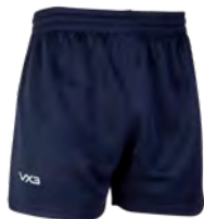
Rugby Short Navy Junior: 91429 Adult: 91430