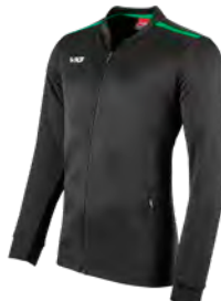
Black/Emerald Junior: 302411 Adult: 302410