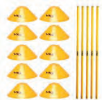
Cone Agility Ladder Code: 63060