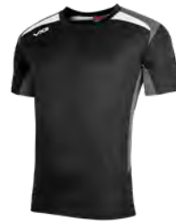
Black/Dark Grey/White Junior: 90401 Adult: 90409