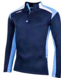
Navy/Sky/White Junior: 90542 Adult: 90550