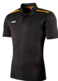
Black/Amber Junior: 302394 Adult: 302393