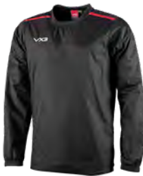
Black/Red Junior: 303499 Adult: 303490

Engineered for training in all weather conditions. The Fortis Smock has been produced with no zips or pockets to ensure safety when training for all sports including full contact activities. The soft handle rip-stop outer shell is tough and lightweight with a windproof, shower resistant finish to keep you warm and dry. The knitted ribbed collar, and warm mesh liner add extra comfort whilst the adjustable hem and elasticated cuff keeps the cold out and ensures the perfect fit. The subtle high-performance silicone detailing and branding combined with a contoured performance fit ensures the principal choice for training in all conditions.