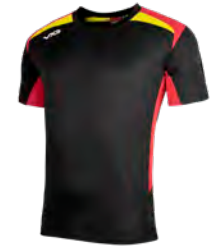
Black/Red/Amber Junior: 28898 Adult: 28897