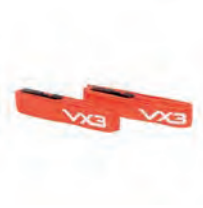
Evasion belt Code: 63048