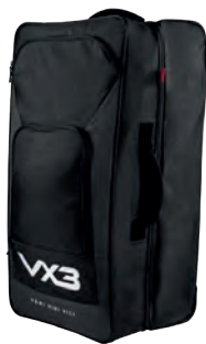
Trolley Bag Black Code: 60764