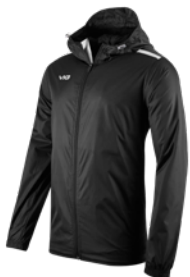
Black/White Junior: 302433 Adult: 302432