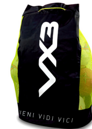
Ball Carrier Black Code: 63080