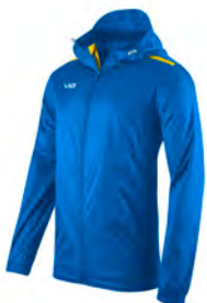
Royal/Yellow Junior: 302502 Adult: 302501