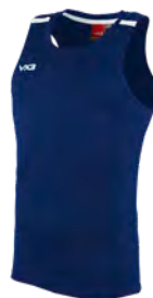
Navy/White Adult: 302474