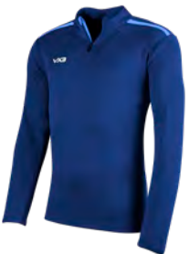
Navy/Sky Junior: 302452 Adult: 302451