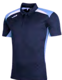
Navy/Sky/White Junior: 90422 Adult: 90430