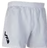
White Junior: 92520 Adult: 92519