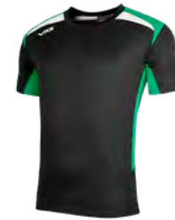
Black/Emerald/White Junior: 90404 Adult: 90412