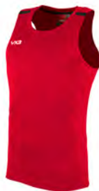
Red/Black Adult: 302487