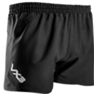
Black Junior: 48647 Adult: 91426

A modern match quality rugby short in a comprehensive range of club colours to compliment any playing kit. The Prima rugby short is produced in a high performance Poly Drill fabric that is durable enough for rigorous training sessions and robust enough to tackle the toughest game. The ergonomic fit, stretch elastane gusset and soft handle moisture wicking fabric ensures there is no compromise on comfort. Whilst the contrast panels, clean lines and high profile VX3 branding complete the professional aesthetic.