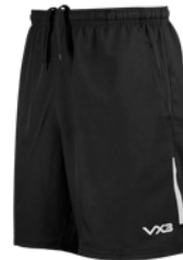
Black/White Junior: 302443 Adult: 302442