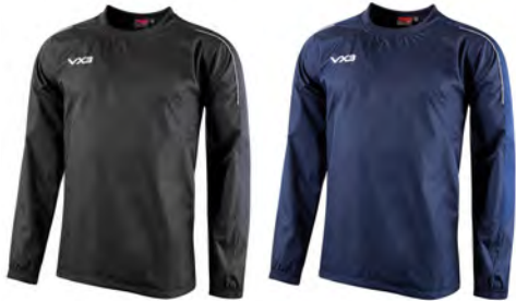
Black Adult: 92337

Engineered as the ultimate in dedicated training wear. The Pro Contact Top has been produced with no zips or pockets to ensure safety when training for all sports including full contact activities. The soft handle rip-stop outer shell is tough and lightweight with a windproof, shower resistant finish and fully taped seams to keep you warm and dry. The knitted ribbed collar, breathable vents and warm mesh liner add extra comfort whilst the adjustable hem and elasticated cuff keeps the cold out and ensures the perfect fit.