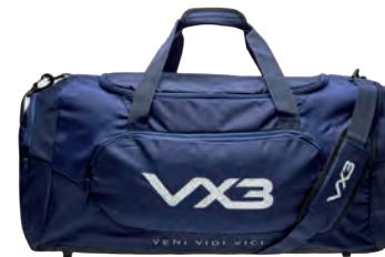
Kit Bag Navy Code: 60756