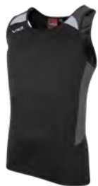
Black/Dark Grey/White Adult: 90395