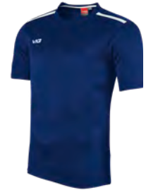
Navy/White Junior: 302473 Adult: 302472