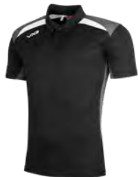
Black/Dark Grey/White Junior: 90417 Adult: 90425