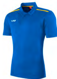
Royal/Yellow Junior: 302508 Adult: 302507