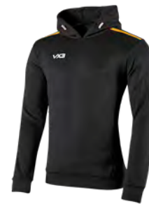
Black/Amber Junior: 302390 Adult: 302389