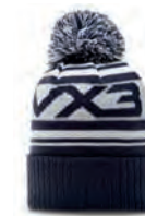
Navy/White Code: 344741