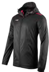
Black/Red Junior: 302418 Adult: 302417

A lightweight full zip jacket with durable rip-stop shell. The Fortis Rain Jacket ensures windproof and water resistant properties whilst remaining lightweight and breathable. The features include zipped secured pockets, a warm mesh lining which keeps you insulated and a dedicated fully functional hood for further protection. The subtle high-performance silicone detailing and branding combined with a contoured performance fit creates the perfect outer layer.