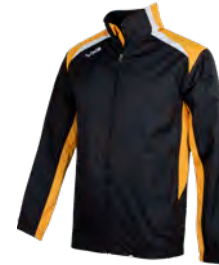
Black/Amber/White Junior: 90451 Adult: 90459