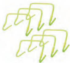
Adjustable Hurdle Code: 63062