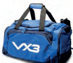
Kit Bag Royal/Navy Code: 60762