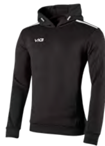
Black/White Junior: 302435 Adult: 302434