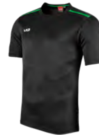
Black/Emerald Junior: 302415 Adult: 302414