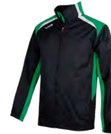
Black/Emerald/White Junior: 90452 Adult: 90460