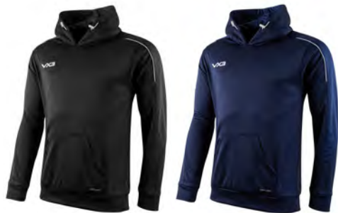
Black/Charcoal/White Adult: 92330

Classic overhead styling in a high performance fabric makes the Pro Hoodie versatile enough for all your training and leisure needs. The super soft 100% Polyester brushed back fleece keeps you warm and the high count micro filament yarn ensures moisture wicks away from the body to keep you dry. The two piece hood with stretch drawcord, sports toggles and contrast liner ensure further protection from the elements and the self-fabric cuff and hem, athletic fit and elevated fabric retains its high quality finish wear after wear.