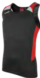
Black/Red/White Adult: 90396

Created for the toughest training session, the Novus Vest keeps you cool when you need it most. The racerback design and quick dry wicking properties ensures the ultimate staple garment for summer training and intense gym workouts.