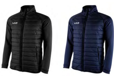
Black Adult: 92345

Optimum insulation whilst allowing full freedom of movement. The Pro Hybrid Jacket combines quilted synthetic fill body panels with soft feel brushed back fleece sleeves and funnel neck collar to achieve warmth and protection whilst retaining a lighter weight. The full zip design, self-fabric cuff and stretch bound hem combined with the athletic fit and high tech fabric guarantees exceptional all round performance.