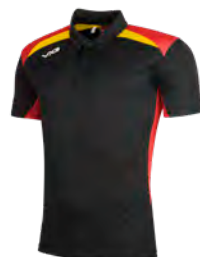
Black/Red/Amber Junior: 288903 Adult: 288902