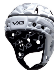
White/Black Adult: AIRF033