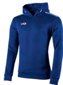
Navy/Sky Junior: 302450 Adult: 302449