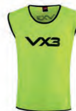
Bib Green Available in Adult, Youth, Youth: 63030