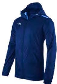
Navy/Sky Junior: 302448 Adult: 302447