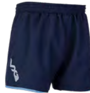
Navy/Sky Junior: 48645 Adult: 91424