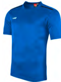
Royal/Navy Junior: 302499 Adult: 302498