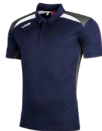
Navy/Dark Grey/White Junior: 91471 Adult: 91472