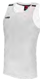
White/Black Adult: 302518