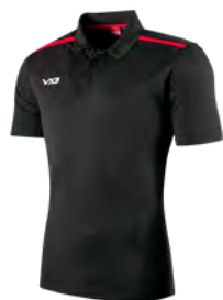
Black/Red Junior: 302424 Adult: 302423

A traditional polo in an up to the minute design. The Fortis Polo combines the classic polo shirt with high performance fabric. The soft handle 100% Polyester fabric offers supreme wicking properties and the breathable anti-cling Poly Pique knit ensures it keeps you cool. The subtle high-performance silicone detailing and branding combined with a contoured fit provides the ideal option for any occasion.