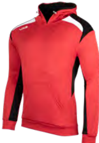
Red/Black/White Junior: 90439 Adult: 90447