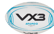
Arundo Ball Size 5 Blue Code: ARUN03