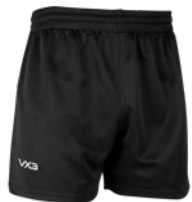
Rugby Short Black Junior: 91427 Adult: 91428

Made from a soft polyester our core range has been crafted with practicality in mind. The range covers both leisure and active use whilst all pieces feature an elasticated drawcord waist. The leisure items include pockets for storing valuables.