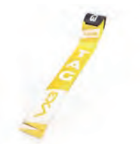
Tag Rugby Belt Yellow Code: 66689