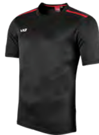
Black/Red Junior: 302430 Adult: 302429

Produced in an updated drop shoulder design with contemporary styling. The Fortis Tee offers clean lines with advanced details in multiple club colourways. The soft handle 100% Polyester fabric wicks moisture away from the skin whilst the breathable anti-cling Micro Dot knit ensures it keeps you cool. The subtle high-performance silicone detailing and branding combined with a contoured fit delivers optimum performance and comfort.