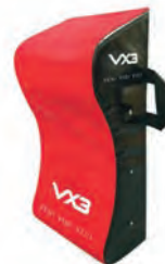
Wave Pad Youth: 45092 Adult: 45093