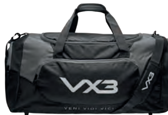
Kit Bag Black/Grey Code: 60757