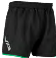
Black/Emerald Junior: 48643 Adult: 91422