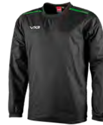
Black/Emerald Junior: 303498 Adult: 303489