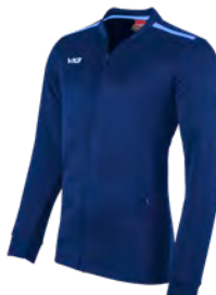
Navy/Sky Junior: 302456 Adult: 302455