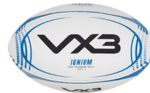
Ignium Ball Size 5 Blue Code: GNUM01