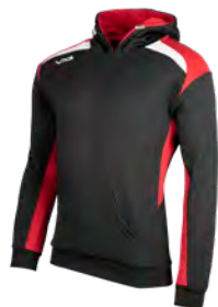
Black/Red/White Junior: 90434 Adult: 90442

A practical and versatile warm layer. Perfect for training and social wear and updated for the modern athlete. The Novus Hoodie is the classic garment for training and warming up in cooler conditions. The brushed back 100% Polyester fleece fabric offers warmth and comfort and ensures wicking. Features include a pouch pocket, adjustable hood with stretch drawcord and sports toggles for safety.