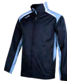
Navy/Sky/White Junior: 90454 Adult: 90462