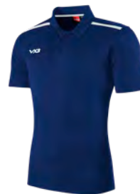
Navy/White Junior: 302467 Adult: 302466