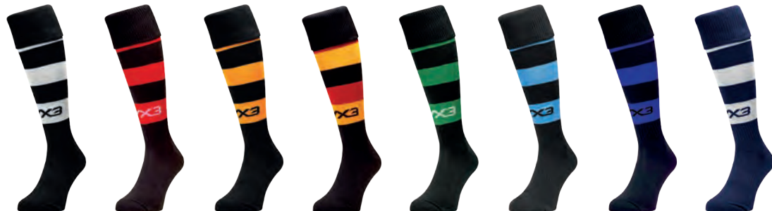
Black/White Black/Red Black/Amber Black/Red/Amber Black/Emerald Black/Sky Black/Royal Navy/White Youth: 92276 Youth: 92278 Youth: 92280 Youth: 92282 Youth: 92284 Youth: 92286 Youth: 92300 Youth: 92288 Adult: 92277 Adult: 92279 Adult: 92281 Adult: 92283 Adult: 92285 Adult: 92287 Adult: 92301 Adult: 92289

Designed for comfort and durability. VX3 Pro Sock is available in a comprehensive range of solid and hooped club colours to compliment any playing or training kit. The soft handle Poly / Elastane fabric is incredibly quick drying and wicks moisture away from the skin. This product has been specially formulated with an Elasticated turn over top that eliminates the need for taping and tie-ups and features an elasticated ankle that adds extra support. The foot features a micro mesh top knit for breathability, elasticated support and padded sole. The hand linked Rosso flat seamed toe adds extra comfort.