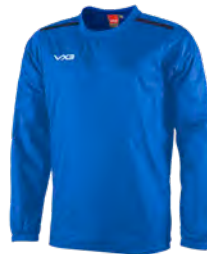
Royal/Navy Junior: 303504 Adult: 303495