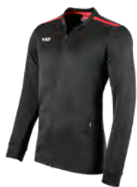
Black/Red Junior: 302426 Adult: 302425

An essential full zip design and modern track top alternative. The Fortis Presentation Jacket has been engineered in a super soft 100% Polyester durable brushed back fleece for ultimate insulation and offers a smart, clean, high quality finish. A neat self-fabric anti pill collar, cuff and open hem combined with the subtle high-performance silicone detailing and branding and contoured performance fit guarantees a professional look both on and off the field.