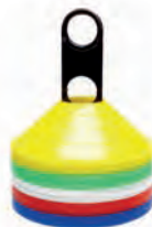
Space Markers Code: 63057