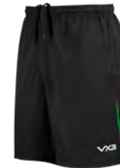
Black/Emerald Junior: 302413 Adult: 302412