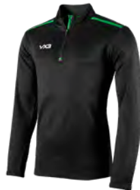
Black/Emerald Junior: 302407 Adult: 302406