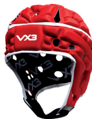
Red/White/Black Youth: AIRF013 Adult: AIRF004

This headguard offers improved peripheral vision and maximum protection and it provides maximum temple and occipital protection. The soft closed cell foams maintain shape after high impact whilst also providing comfort. IRB approved.