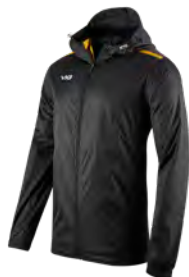
Black/Amber Junior: 302388 Adult: 302387