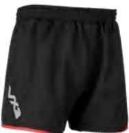
Black/Red Junior: 48644 Adult: 91423