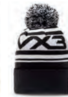
Black/White Code: 344742