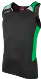
Black/Emerald/White Adult: 90398