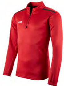
Red/Black Junior: 302480 Adult: 302479