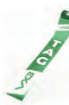
Tag Rugby Belt Green Code: 66684