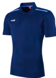
Navy/Sky Junior: 302454 Adult: 302453