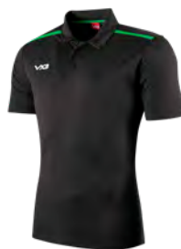
Black/Emerald Junior: 302409 Adult: 302408