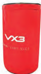
Youth Half Tackle Bag Code: 45102