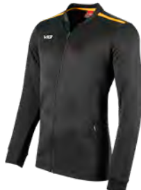
Black/Amber Junior: 302396 Adult: 302395