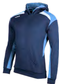
Navy/Sky/White Junior: 90438 Adult: 90446