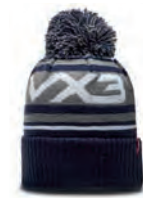
Navy/Grey/White Code: 62848