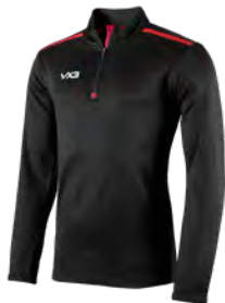
Black/Red Junior: 302422 Adult: 302421

The essential mid-layer garment for athletes from all sporting codes. The Fortis Half Zip Sweat has been developed for training and travel wear. Crafted in a super soft 100% Polyester durable brushed back fleece guaranteed to keep you insulated. The zipped neck design with chin guard, elasticated cuff and open hem design offers unrivalled comfort. The subtle high-performance silicone detailing and branding combined with a contoured performance fit ensures a fundamental addition to your training and off-field wear.