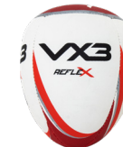
Reflex Rebounder Ball Red Code: REFL01-ONES