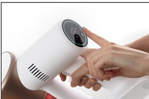
One-button self-locking design