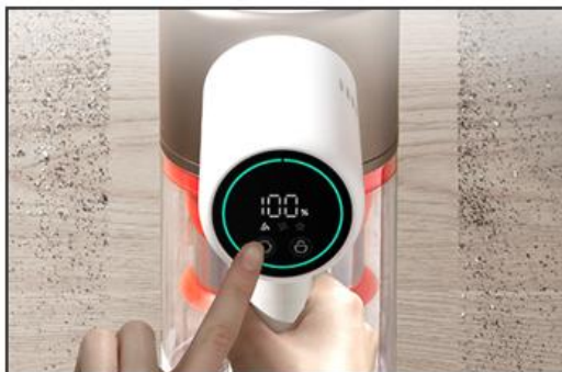
High-quality LED operation interface