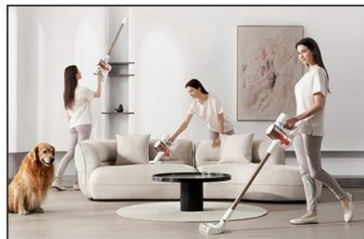
New 3+1 functional brush head set