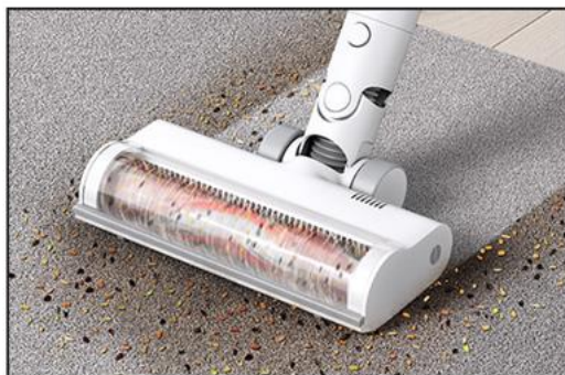
Ultra-long battery life