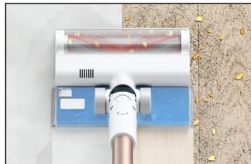
Vacuum and mop all in one go