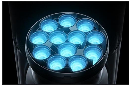
12-cone cyclone dust-separation system