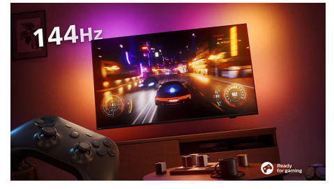
Play without limits and immerse yourself in OLED's incredible realism! HDMI 2.1, a

blazing-fast 120 Hz native refresh rate and ultra-low input lag bring fluid, responsive gameplay, super-smooth natural motion and great-looking graphics. Ambilight's gaming mode brings even bigger thrills and, if you're gaming on a PC, you can enjoy 144 Hz VRR via HDMI.