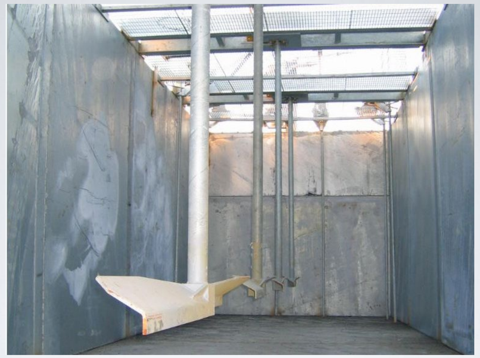
EXPANDABLE GALVANIZED ABOVE GROUND SLURRY TANKS 3 HP MOTOR AGITATORS KEEP SLURRY IN SUSPENSION. MOTORS OPERATE 5 MINUTES ON AND 10 MINUTES OFF