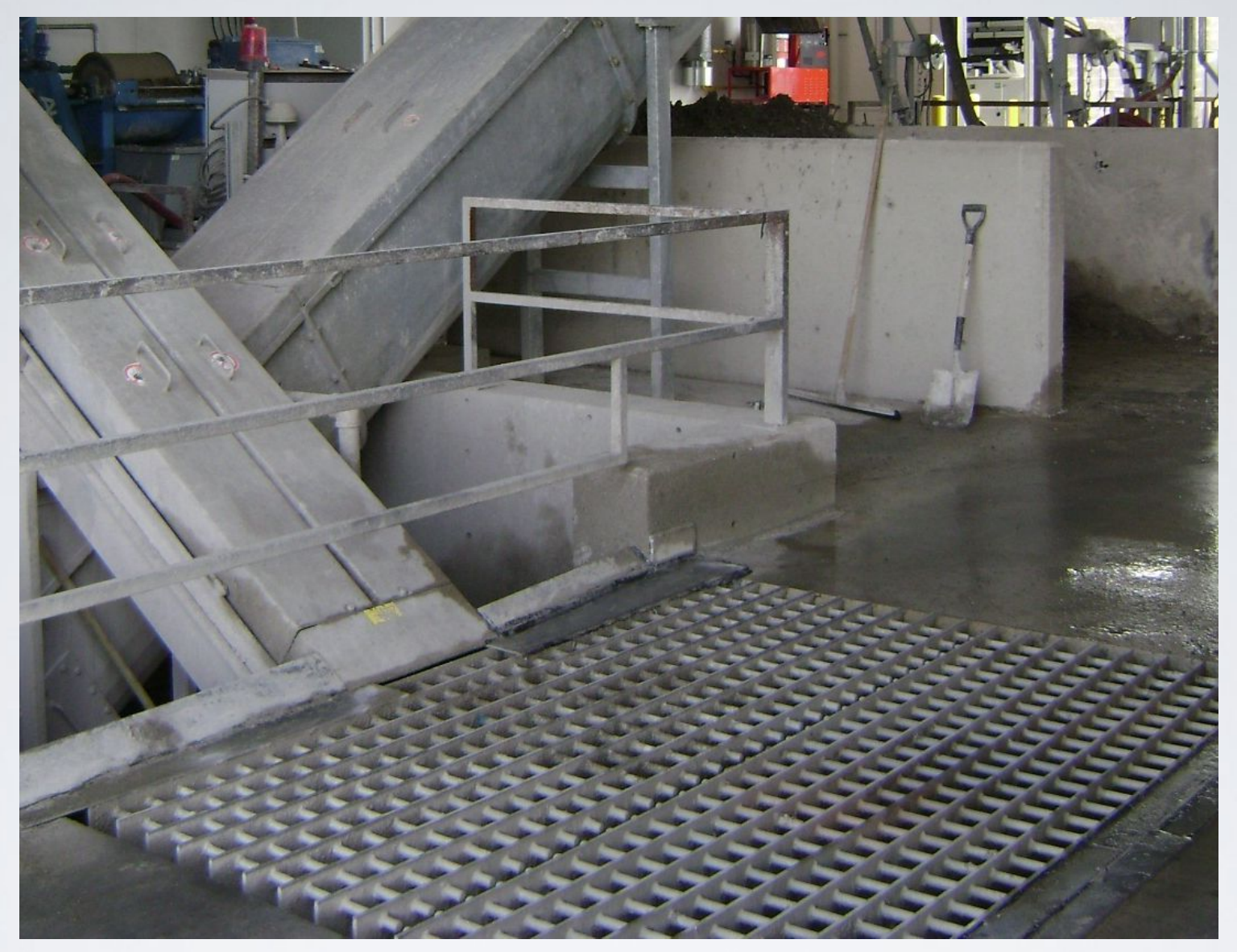
BIBKO PUMP DISCHARGE CONVEYOR (PDC) FOR WASHOUT OF CONCRETE PUMPS INTO BIBKO CONCRETE RECLAIMER