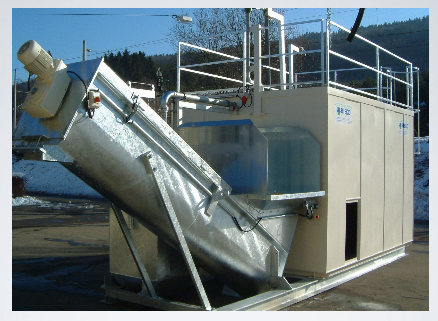
BIBKO 1000 PORTABLE JOB-SITE CONCRETE RECLAIMER AND WASHOUT