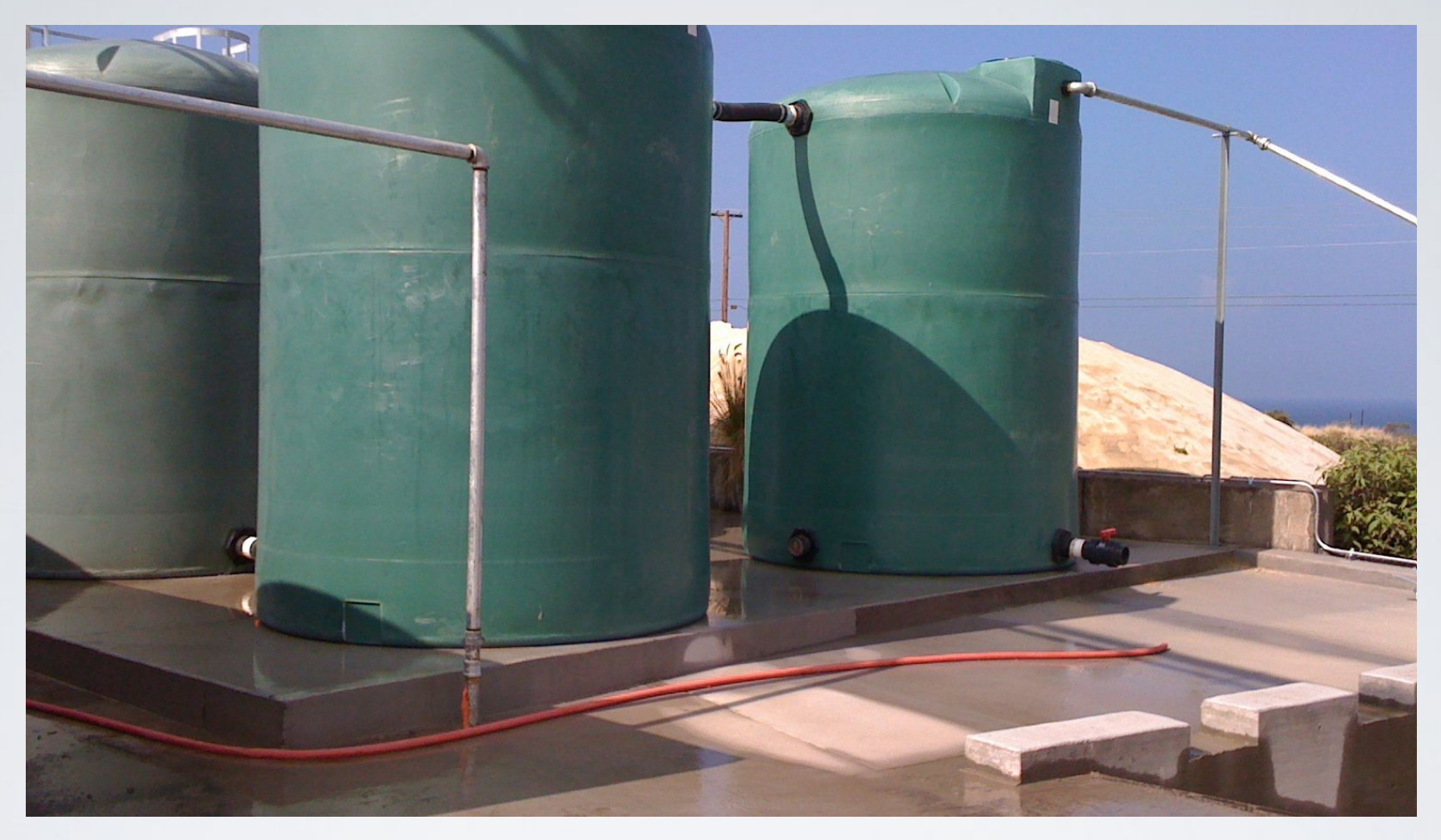
DILUTION OF SLURRY WATER WITH COLLECTED YARD WATER YARD WATER IS AUTOMATICALLY FED INTO SLURRY TANK BY PLC AUTOMATION