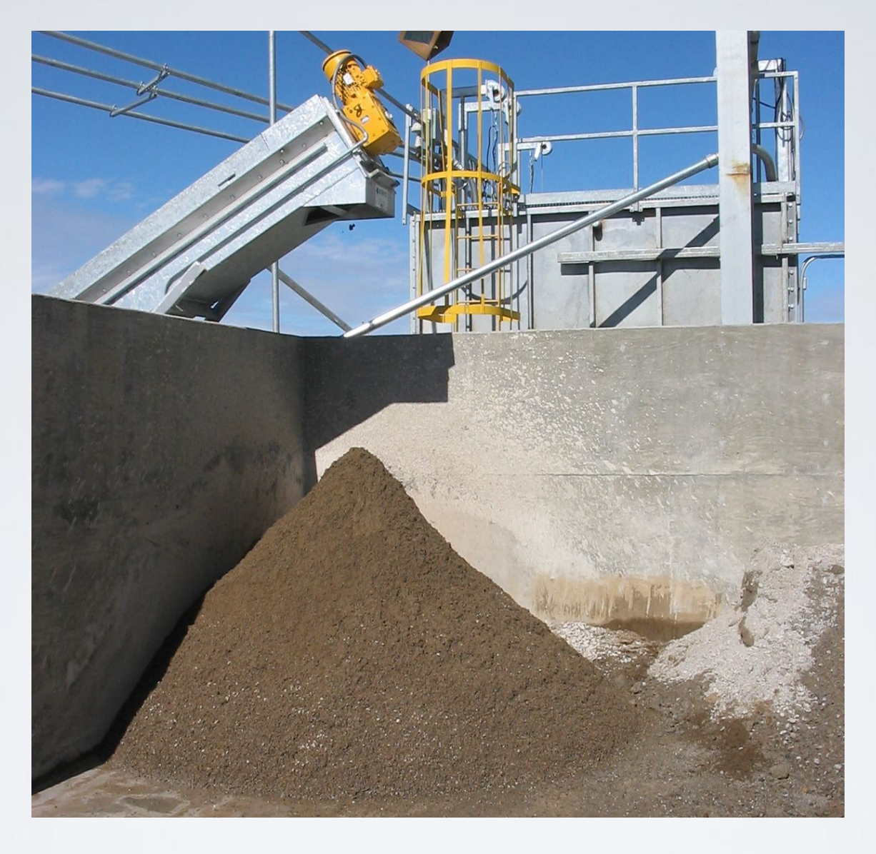
DISCHARGE OF CLEANED SAND AND AGGREGATE OPTIONAL SINGLE AND DOUBLE SCREEN DECK NOT SHOWN