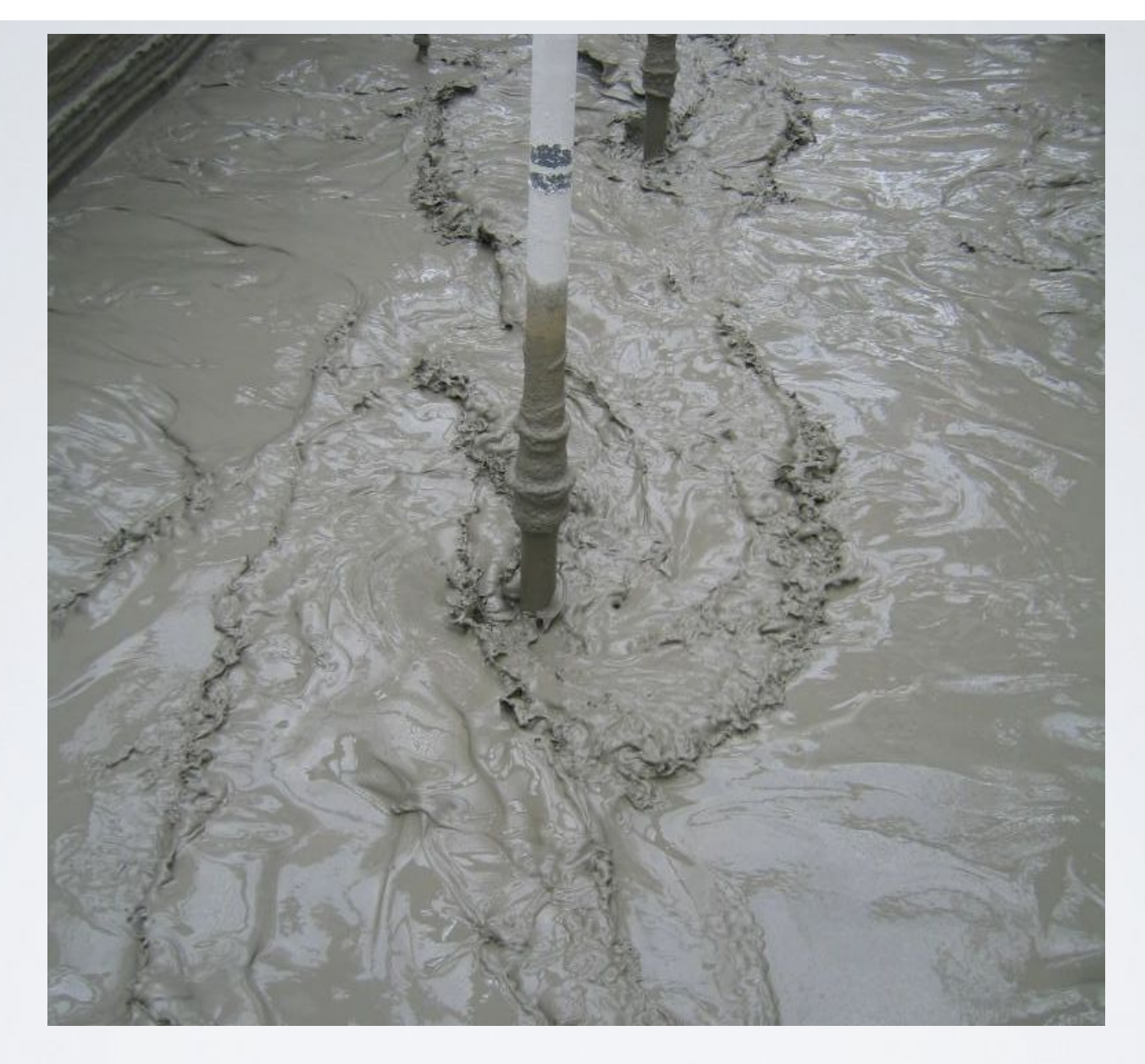
AGITATED SLURRY TANK DENSITY PROBES DISPLAY REAL-TIME SPECIFIC GRAVITY AND TEMPERATURE OF SLURRY