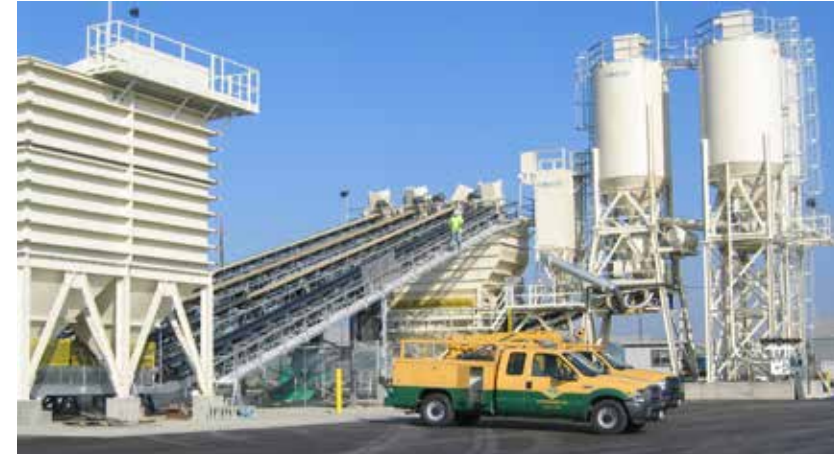
CON-E-CO BatchMaster with 800 Ton Aggregate Bunker. As shown $1,600,000.00