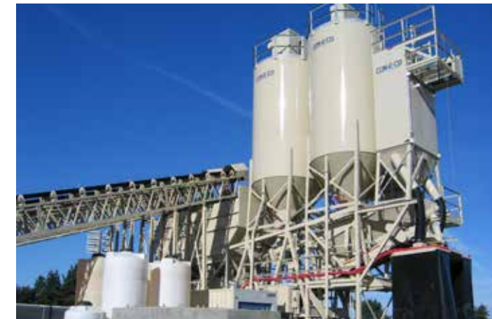
CON-E-CO Lo-Pro 12RS Portable Concrete Batch Plant. As shown $676,000.00