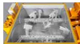
Twin shaft mixer

PEARSON PORTABLE HOT AND CHILLED WATER SYSTEMS