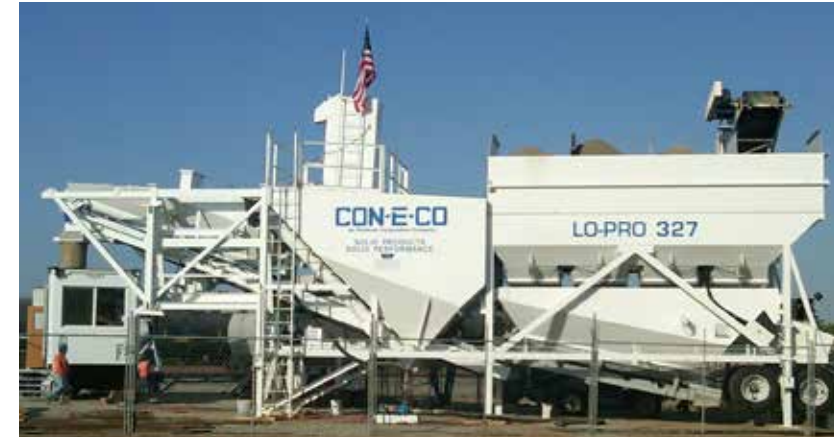
CON-E-CO Lo-Pro 327 Mobile Portable Concrete Batch Plant. Starting at $365,000.00