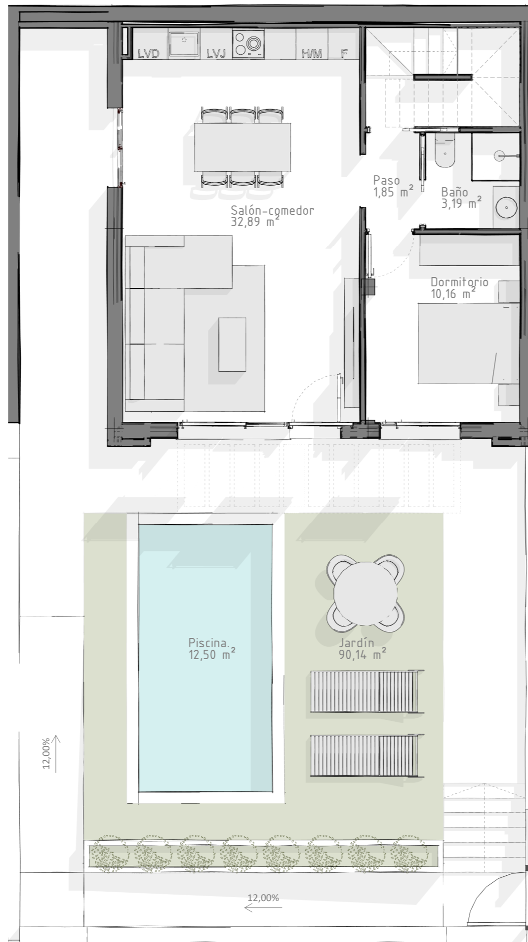
10.Viv. Unifamiliar. Planta baja