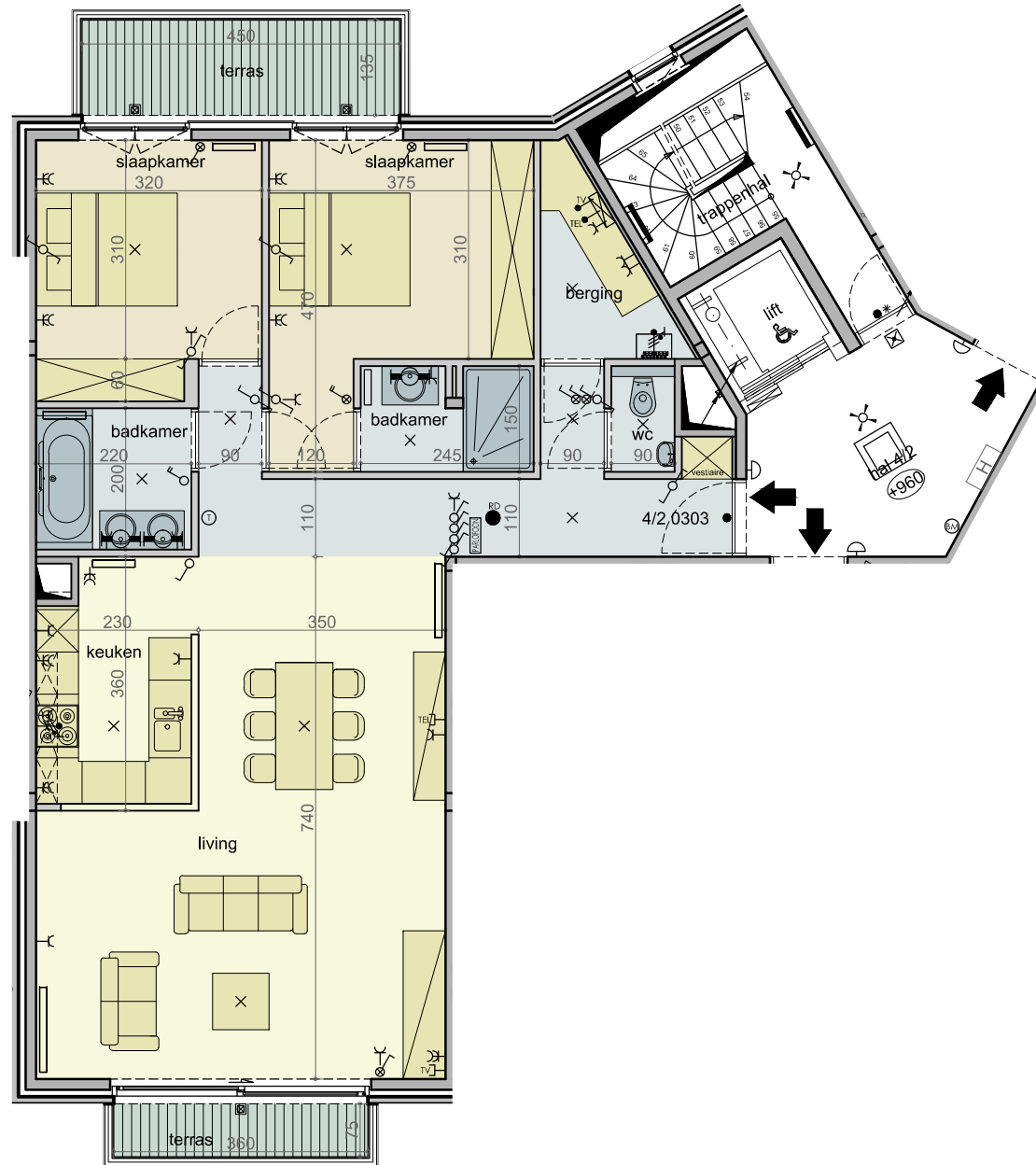
3e verdieping appartement 4/2 0303, schaal 1/100