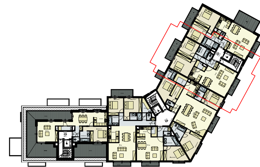
Positie in bouwblok, schaal 1/500