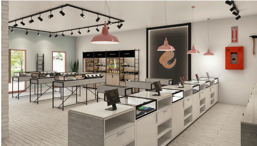
Sample rendering of Retail Store Interior