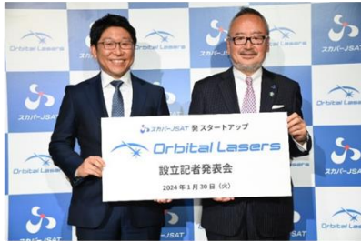
Establishment of Orbital Lasers (2024)