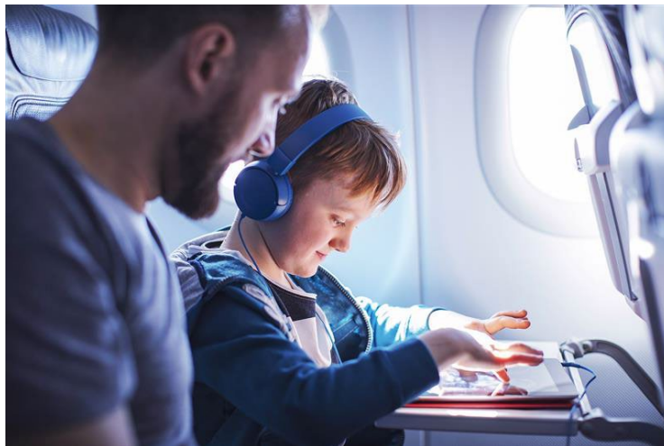
In-flight Wi-Fi Usage Image

To provide in-flight Wi-Fi service available over Japan for airlines in Japan and across Asia, the “Superbird-C2” satellite will be repositioned from its current orbital location at 144°E to a new orbital slot. The service is scheduled to begin this winter.