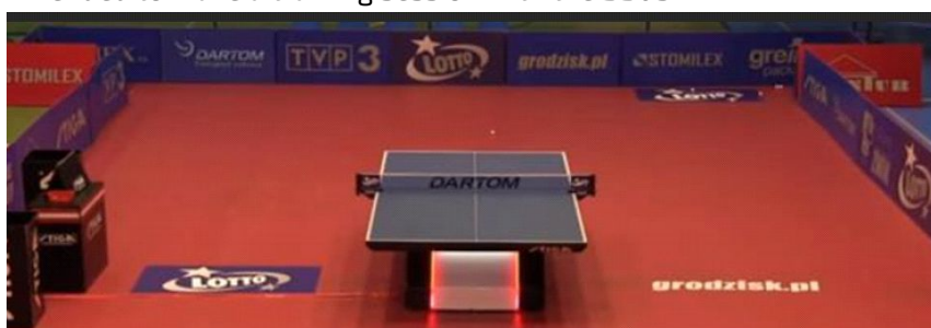
example - show court with BBGs zones

The clubs are recommended to make a training session with the BBGs.