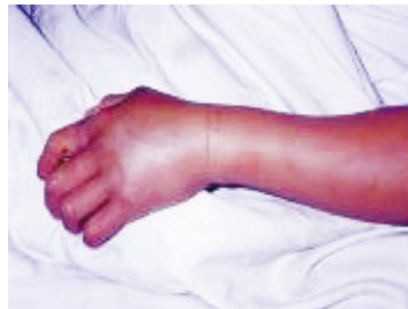
Fig. 4 Swelling of the forearm after a Trimeresurus mucrosquamatus bite