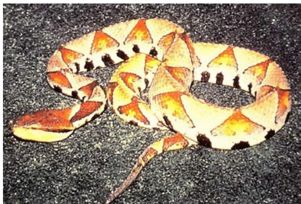
Fig. 5 Deinagkistrodon acutus

or systemic hemorrhage, necrosis of the skin, muscle, and subcutaneous tissue, respiratory collapse and possible death. Maintaining stable life signs is the chief strategy of treatment (23) . This is a medium-sized snake that grows to a maximum length of 150 cm. The body is slightly thick with a triangular head and upturned rostrum. There are triangular black marks on both sides of the body, so it is easy to identify. Dangerous animals often have exaggerated reputations and this species is no exception. The popular name “hundred pacer” refers to a local belief that, after being bitten, the victim will only be able to walk 100 steps before dying. In some areas, it is even called the “fifty pacer.” This species is considered dangerous, and fatalities are not unusual. According to the US Armed Forces Pest Management Board, the venom is a potent hemotoxin that is strongly hemorrhagic. The toxic substances include ADPase, 5'-nucleotide, phospholipase A2 and fibrinogenase, with ADPase causing significant inhibition of platelet aggregation, resulting in a decrease in platelets and bleeding tendencies. Bite symptoms include severe local pain and bleeding that may begin almost immediately. This is followed by considerable swelling, blistering, necrosis, and (Fig. 5-6) ulceration. Systemic symptoms, which