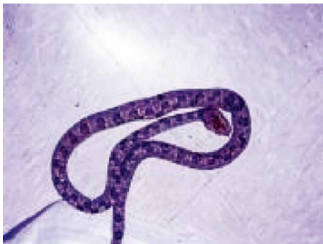
Fig. 3 The Trimeresurus mucrosquamatus which bit the patient in Fig 4

stejnegeri envenoming in Taiwan are largely similar to those of other pit vipers in Southeast Asia (4) . Nevertheless, Trimeresurus mucrosquamatus envenoming causes more severe clinical manifestations than Trimeresurus stejnegeri , reflecting the differences in the amount, potency, and constituents of the venom in these two pit vipers. Because of the higher toxicity, patients with Trimeresurus mucrosquamatus envenoming are more likely to develop life-threatening complications and needed higher doses of antivenom and longer hospitalizations than patients bitten by Trimeresurus stejnegeri . Culprit snakes can be identified and documented by emergency physicians by either identifying the snake brought in by the patient and or having the patient identify a picture of the snake. The two species are easily distinguishable because of their markedly different color patterns and lengths. Trimeresurus stejnegeri averages about 70 cm (ranging from 50 to 90 cm) long, and is bright to dark green over the dorsal side and pale green to whitish on the ventral side. Trimeresurus mucrosquamatus is longer, with an average length of about 120 cm (ranging from 100 to 150 cm). It is grayish or olive brown on the dorsal side, with a pattern of shells of continuous large brown, black-edged patches, and a whitish belly heavily powdered with light brown. There are no other pit vipers with a similar appearance