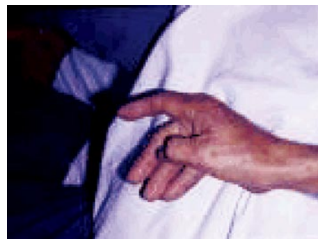
Fig. 8 No obvious symptoms are noted on this patient's right hand after a Bungarus multicinctus snakebite