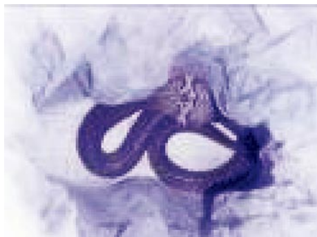
Fig. 12 The Naja atra bite in the patient in Fig. 13

the tongue was a habit associated with addiction to heroin, cannabis and mandrax (34) . We reported a snake charmer with an unusual presentation of a Taiwan cobra ( Naja atra ) snakebite with significant local tissue injury and necrosis of the tongue. The patient received polyvalent snake antivenom almost 1 hour after the bite. The patient had no respiratory insufficiency, neurotoxicity, or renal failure. Tongue damage rapidly resolved after early and aggressive antivenom treatment. The tongue remained well perfused and viable, and tongue mobility was good. The tongue possesses a rich blood supply that provides resistance to necrosis, allows lacerations to heal quickly, and offers these patients the potential for tongue preservation. Tongue snakebite damage rapidly responds to polyvalent snake antivenom, so the sequelae of tongue amputation and loss of ability to speak can