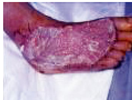
Fig. 15 Split-thickness skin grafting