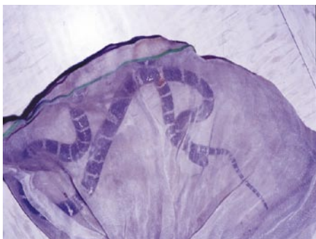
Fig. 7 A Bungarus multicinctus snake caught at the scene