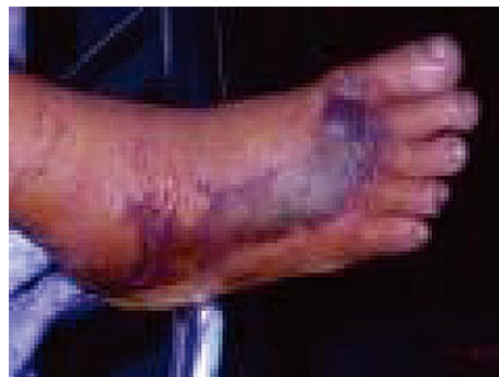
Fig. 13 Swelling of the dorsum of the foot after a Naja atra bite