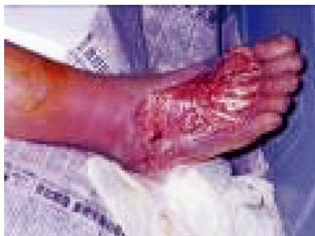
Fig. 14 Surgical debridement to remove necrotic tissue on the foot