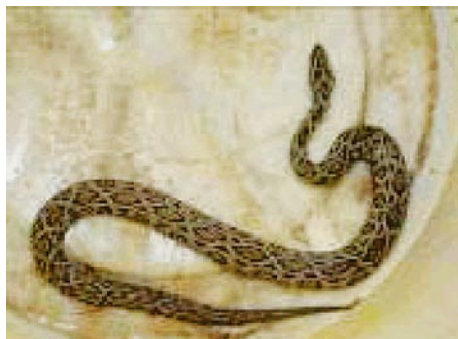
Fig. 21 Vipera russelli formosensis

Any snake bite in Taiwan should be treated very seriously. Although there are more non-venomous than venomous snakes, some of the