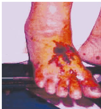
Fig. 6 Swelling of the dorsum of the foot with a blood blister in a patient bitten by Deinagkistrodon acutus