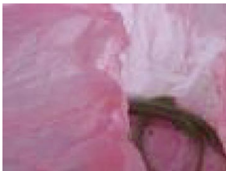
Fig. 1 The Trimeresurus stejnegeri bite in the patient in Fig. 2

Trimeresurus stejnegeri , it is also called the red tail bamboo viper because of its green body and red tail. Nontoxic green snakes have a green tail. The head is triangular with a pit between each eye and the nose containing blood vessels and the trigeminal nerve distribution. This acts as a temperature probe which can detect subtle ambient temperature changes which the snake uses when searching for prey such as small mammals. The mouth has a pair of solenoglyphic teeth, which leave obvious fang marks on the victim. The snake is about 50 cm long and its body color is common in tree snakes. It has a hemorrhagic toxin, and the mechanism of action remains unknown. The main toxic components affect bleeding (hemorrhagic factors HR1 and HR2), coagulation components (platelet aggregoserpentin), and anti-clotting components (platelet aggregation inhibitor, 5'-nucleotide enzyme), and show high concentrations of procoagulant effects (like the thrombin effect), low concentrations with hemolysis. The snake is found in southeastern mainland China and Taiwan. It tends to attack ferociously and the bite area can have swelling, bleeding, and blisters (Fig. 1-2). It is the most