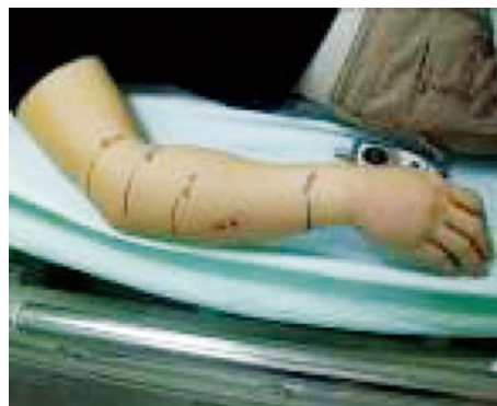
Fig. 2 Swelling of the forearm in a patient bitten by Trimeresurus stejnegeri