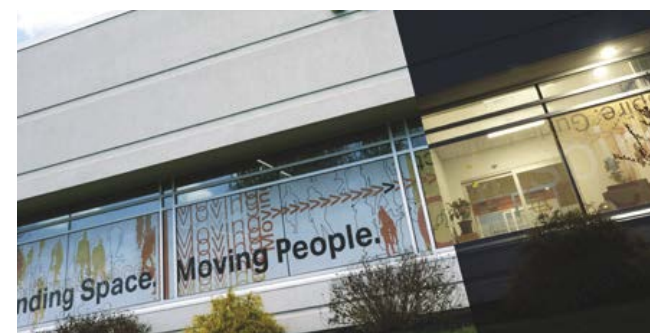
Day/Night Visibility Comparison