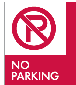
Restricted TR10X11,5-A 10.0"w X 11.5"h