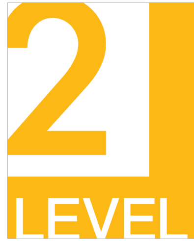
Level ID TR16X20-A 16.0"w X 20.0"h