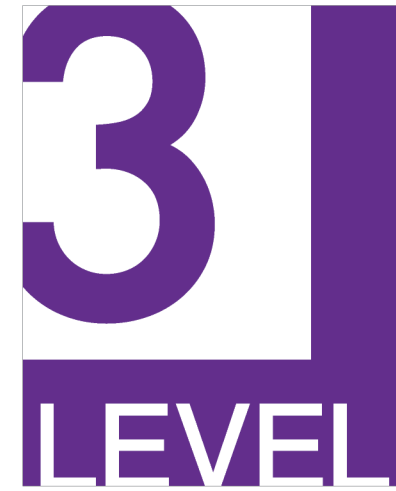
Level ID TR16X20-A 16.0"w X 20.0"h