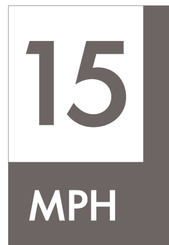
Limit TR14X20-A 14.0"w X 20.0"h