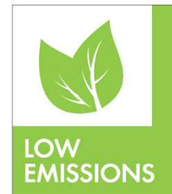
Special Reserved TR10X11,5-A 10.0"w X 11.5"h