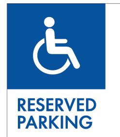
Reserved TR10X11,5-A 10.0"w X 11.5"h