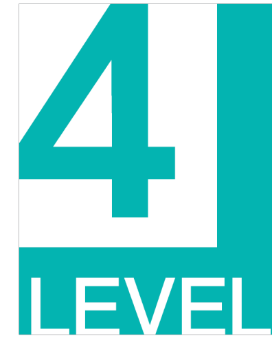
Level ID TR16X20-A 16.0"w X 20.0"h