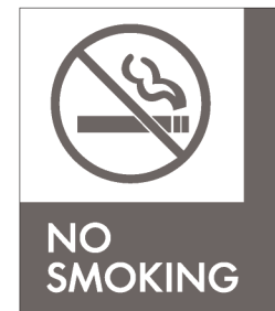
No Smoking TR10X11,5-A 10.0"w X 11.5"h