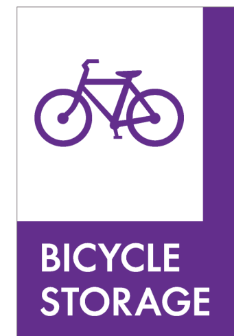
Zone TR14X20-A 14.0"w X 20.0"h