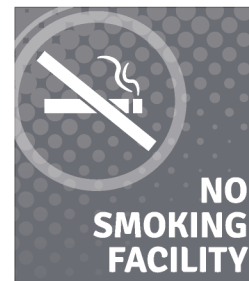
No Smoking TR10X11,5-A 10.0"w X 11.5"h