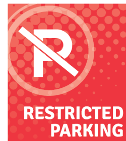
Restricted TR10X11,5-A 10.0"w X 11.5"h