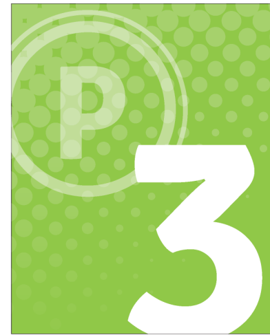
Level ID TR16X20-A 16.0"w X 20.0"h