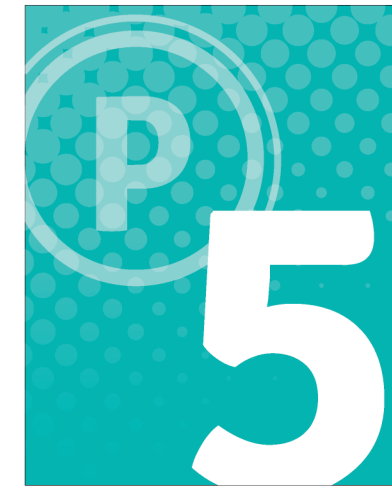
Level ID TR16X20-A 16.0"w X 20.0"h