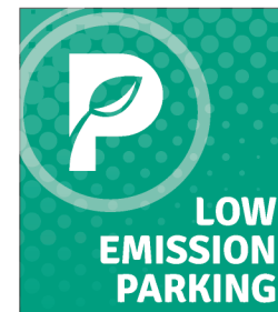
Special Reserved TR10X11,5-A 10.0"w X 11.5"h