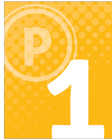
Level ID TR16X20-A 16.0"w X 20.0"h