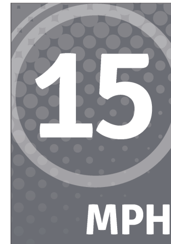
Limit TR14X20-A 14.0"w X 20.0"h