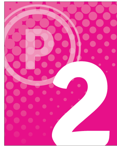
Level ID TR16X20-A 16.0"w X 20.0"h