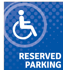
Reserved TR10X11,5-A 10.0"w X 11.5"h