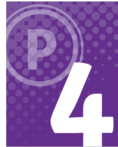
Level ID TR16X20-A 16.0"w X 20.0"h