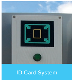
ID Card System