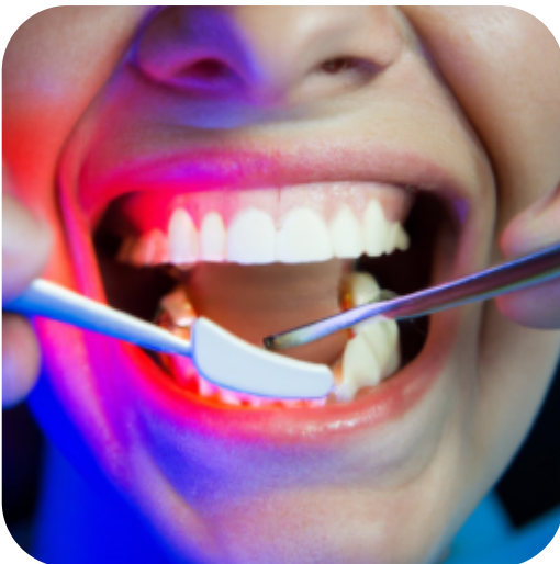
Teeth Whitening Myths

Regular use of whitening mouthwash, combined with good oral hygiene practices and regular dental checkups, can help maintain a brighter smile and support overall dental health for vapers.