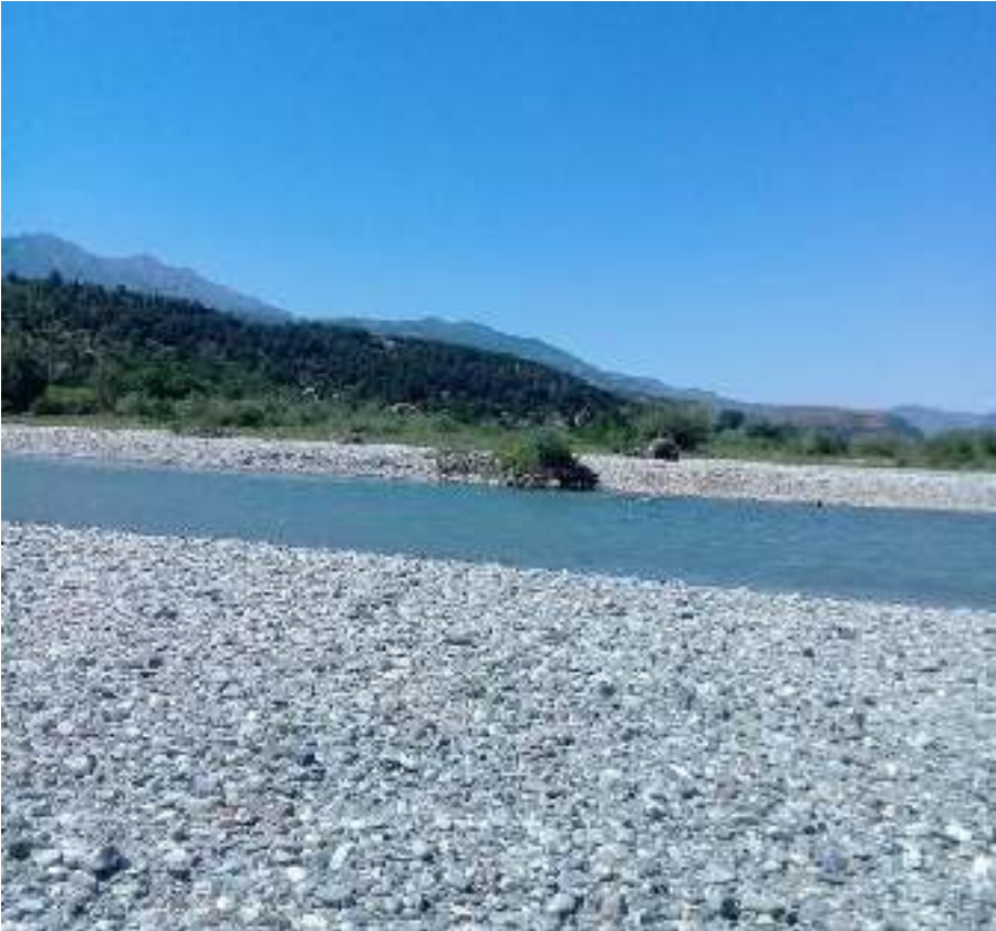
We will utilise natural and existing materials for the construction

Construction of 200 MW cascading hydro power plant approximately 2 to 3 years The price of construction would be approximately 220,000,000 euros Repayment of investment based on above model would be 4 to 5 years