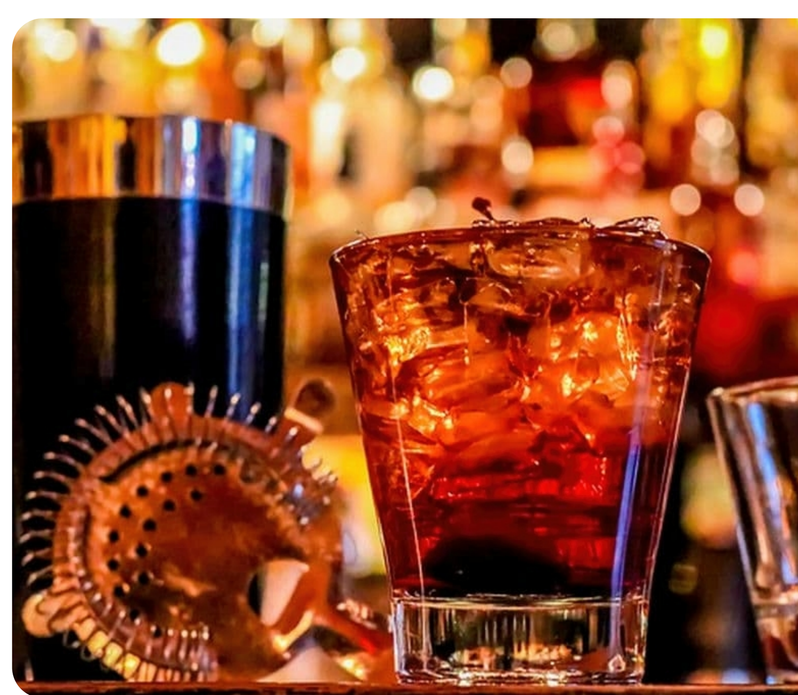
Make the right choice: Gaining insight into Part-Time and Full-Time Bartending Careers

through the year. This constant cycle of events provides a steady supply of job opportunities for bartenders and contributes to a more thriving and long-lasting job market in the hospitality sector. The city's lively festival scene does more than enrich its culture, but also contributes to the economy by supporting jobs in the bartending and more general hospitality industry. Bartenders in Fort Worth, these events are more than occasions to celebrate; they are crucial components of their work lives.