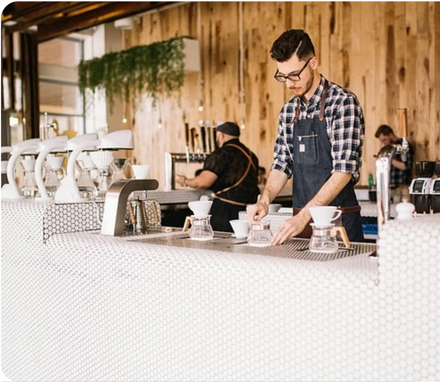
The Right Decision: Insights into Full-Time and Part-Time Bartending careers