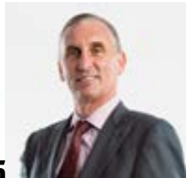
Bobby Hurley Head Coach