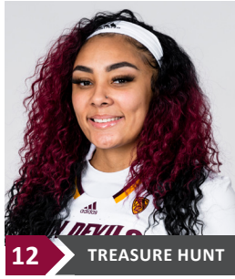
12 ▶ TREASURE HUNT

Junior | Guard | 6-1 Portland, Ore. | Beaverton