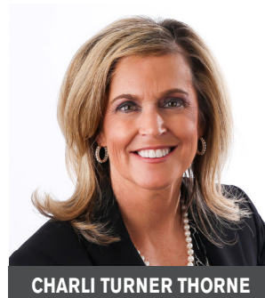
CHARLI TURNER THORNE