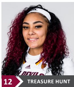
12 ▶ TREASURE HUNT

Junior | Guard | 6-1 Portland, Ore. | Beaverton