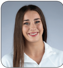
ABI SOLARI AA | 5-3 | SO Portishead, England