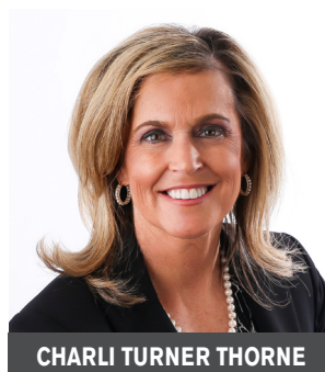
CHARLI TURNER THORNE