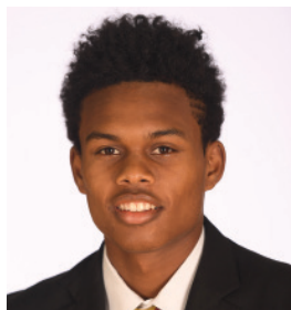
#0 TRA HOLDER