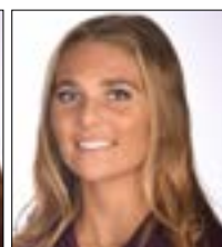
28 Cabrini Class D • FR Baltimore, Md.