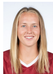
5 Sierra Enge RS-Fr. • D/M • 5-5