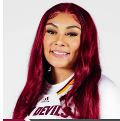
12 TREASURE HUNT

Senior | Guard/Forward | 6-3 Kingston, Ontario | Holy Cross Secondary School