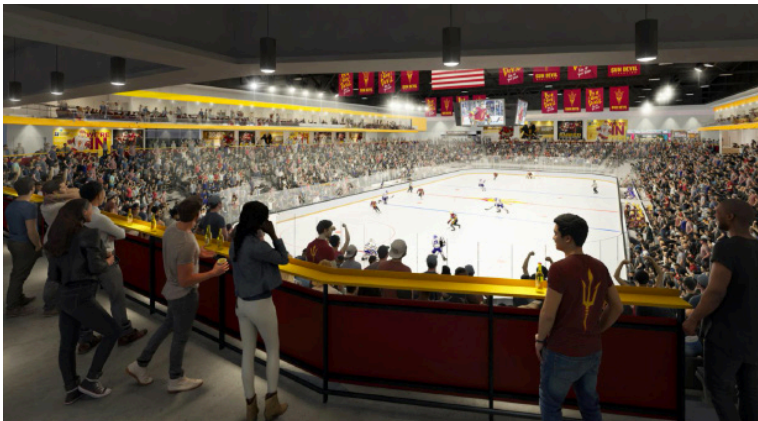
VIEW FROM MAIN CONCOURSE