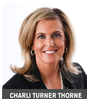
CHARLI TURNER THORNE