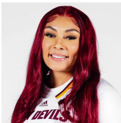
12 TREASURE HUNT

Senior | Guard/Forward | 6-3 Kingston, Ontario | Holy Cross Secondary School