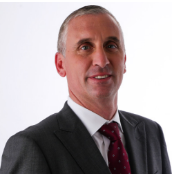
Bobby Hurley Head Coach