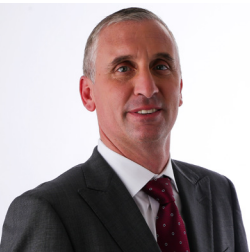
Bobby Hurley Head Coach