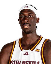
Dame Salane C • 7-1 • Fr.